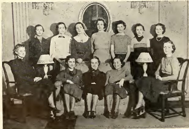
THE SENIOR GRANDDAUGHTERS