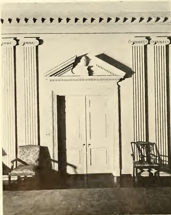
DOORWAY — RECEPTION HALL

Heating and plumbing contractor: Crutchfield-Sullivan Co.