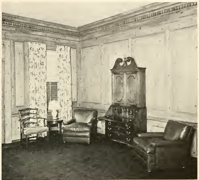
A CORNER OF THE HOUSE LIBRARY

In the south wing on the first floor are found the alumnae offices. A little more roomy than the ones formerly occupied in administration building, they will take care of, for some time at least, the rapidly increasing number