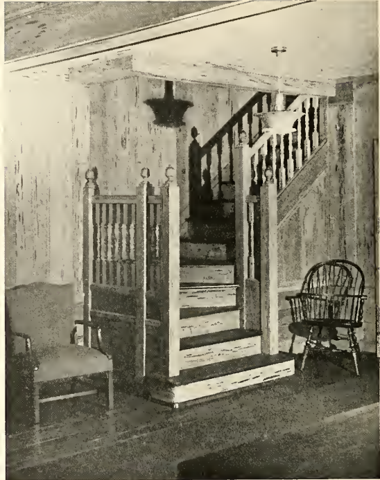
INGLE NOOK IN THE PECKY CYPRESS ROOM

Which of all the enchanting features captures the eye first?—the thirty-two pilasters around the walls, the tall windows, the French doors opening out on the western balcony? Perhaps the chandeliers. The chandeliers, espe-