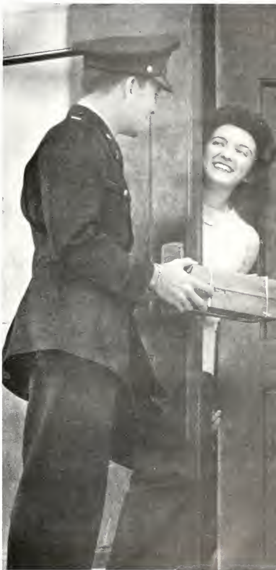
"ON MANOEUVERS"—AT SPENCER DORM!

There isn't even a name for it. It isn't a hospital; this is strictly private medicine. * * "It's cheaper to keep a hundred men from getting combat jitters than to try to salvage one after he's cracked. A week of prevention is worth a year of cure." * * *