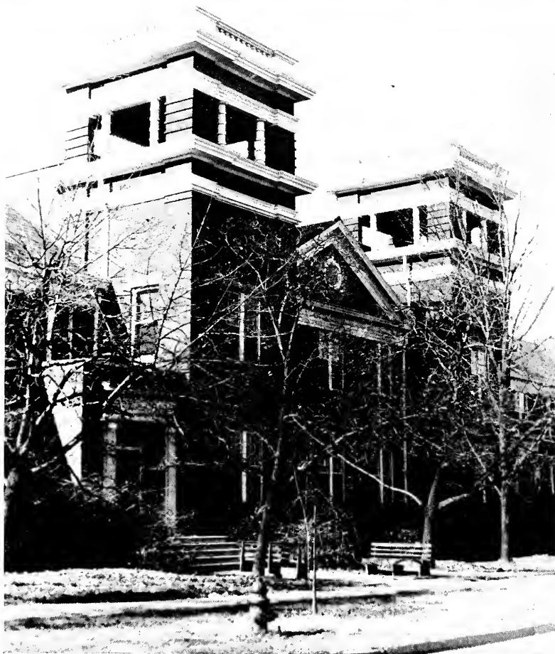
SPENCER TOWERS