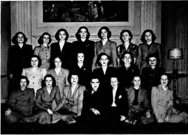
GOLDEN CHAIN MEMBERS