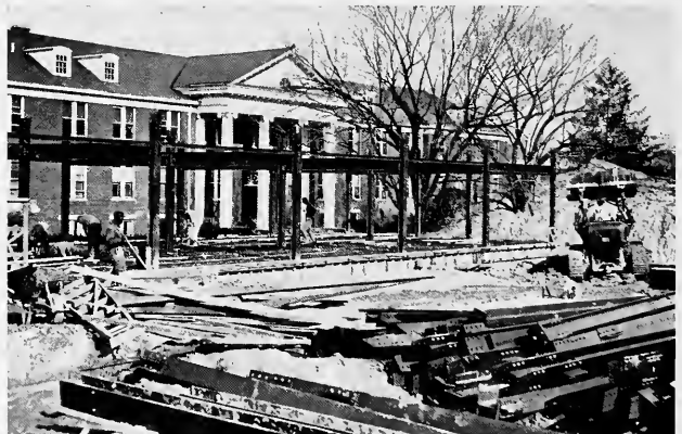
CONSTRUCTION WORK ON THE NEW LIBRARY Spencer Hall in the background

Completion of the Chapel Fund is one of our Chancellor's fondest dreams and this is our opportunity to help make that dream come true.