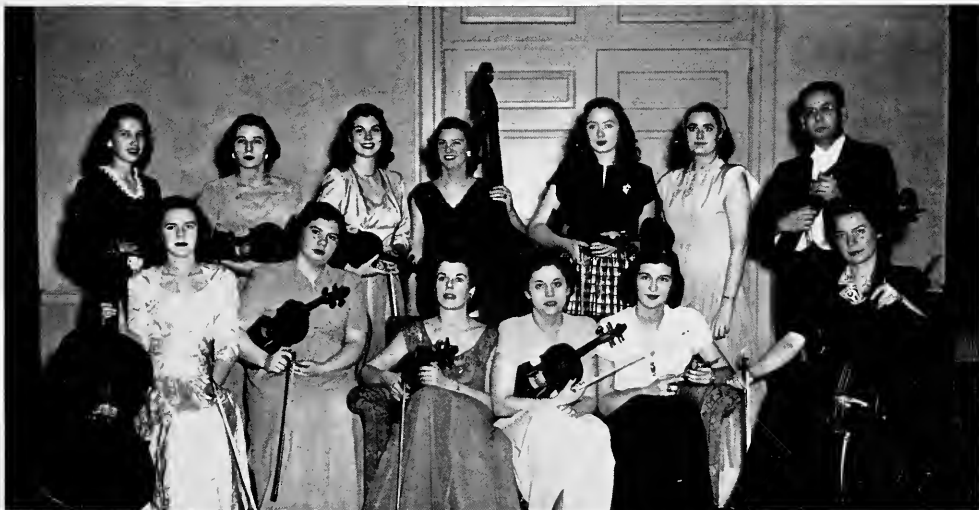
WOMAN'S COLLEGE CHAMBER MUSIC GROUP

Important Dates, May 28, 29, 30, Commencement.