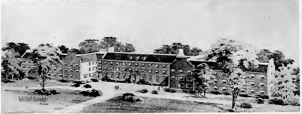
Above are shown the two new residence halls at Woman's College, contracts for which were let early in February. The halls will be located facing Coit Hall, between Kirkland and Weil.