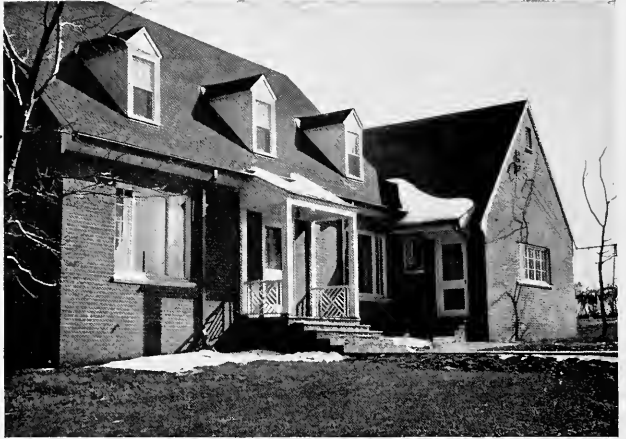
THE NEW HOME ECONOMICS COTTAGE AT CURRY SCHOOL

225 SOUTH DAVIE STREET GREENSBORO, N. C.