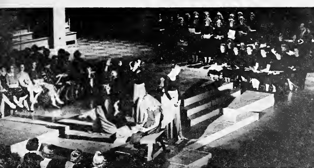
"WE, THE WOMEN"