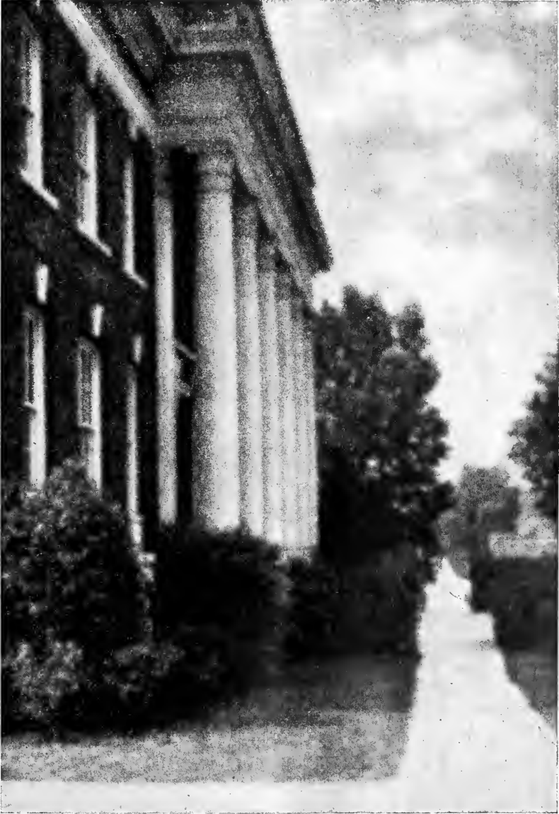
AYCOCK AUDITORIUM WHERE COMMENCEMENT EXERCISES ARE HELD