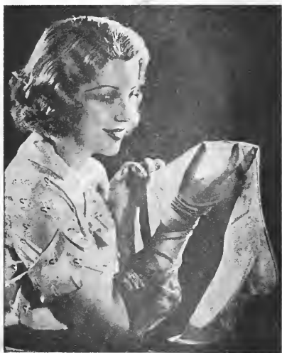
GLEND A FARRELL, star of Warner Bros. picture "Miss Pacific Fleet," admires the crystal clearness of her Mojud Clari-phane silk stockings.