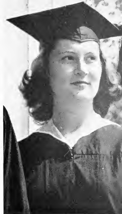
"The future I may face, now I have proved the past"