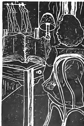
"We do study."