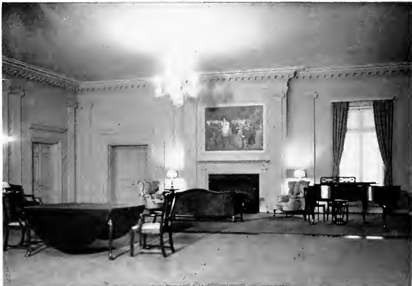
View of Reception Hall — Alumnae House