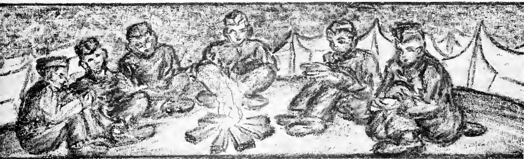
"Until it's over, over there!"