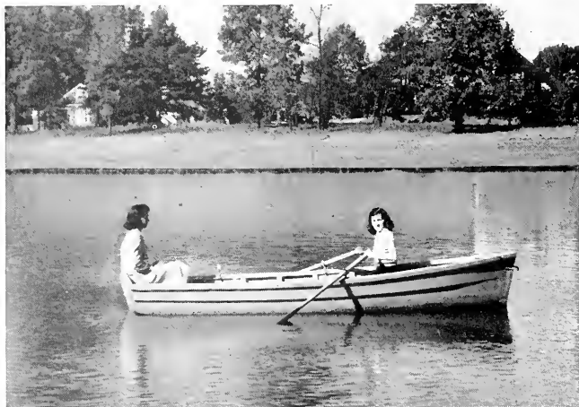
Rowing on the Campus Lake

And as a part of the Greater University of North Carolina, Woman's College is on the threshold of more important things. In that consolidation move, provided for by the General Assembly of 1931, faculty, students, and alumnae have gained much and will gain even more. In no respect has this institution surrendered its status, and at the same time, it has gained much in stature. There will be a continuing recognition of the importance of the Woman's College unit of the state's university system. The unit maintained here in Greensboro, at an almost geographic center of the state, established for the education of the womanhood of the state, will not be overlooked or neglected, but will continue its wonderful development and growth in the sure truth—so often stated—that when you educate a woman you are likely to be educating a family.