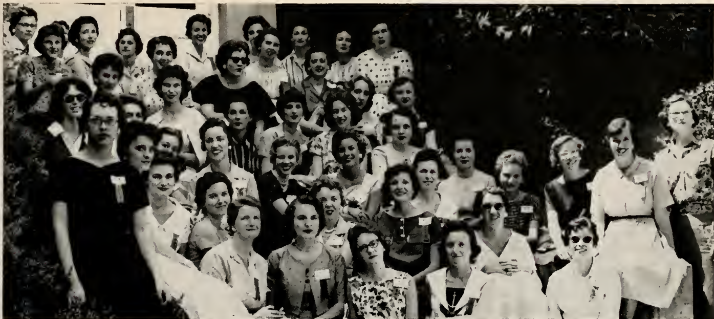
CLASS OF 1955

'50 The members of the Class of 1950 seemed to have a good time observing and talking about the changes which ten years had brought about in themselves and in the College. Despite the passing of the "fabulous fifties" decade, everyone was recognizable.