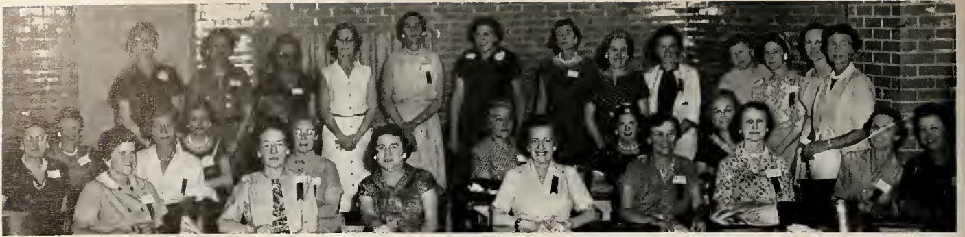
CLASS OF 1935