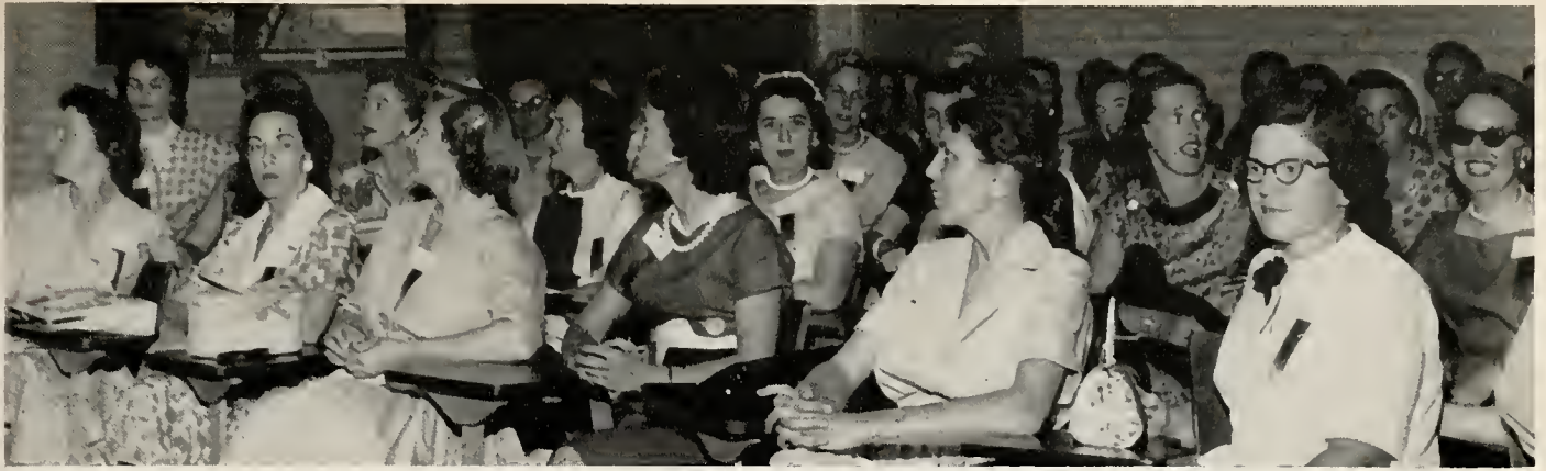
CLASS OF 1944 "in part"