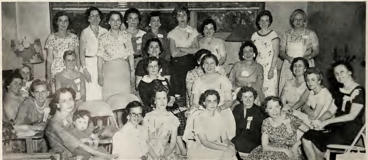
CLASS OF 1942