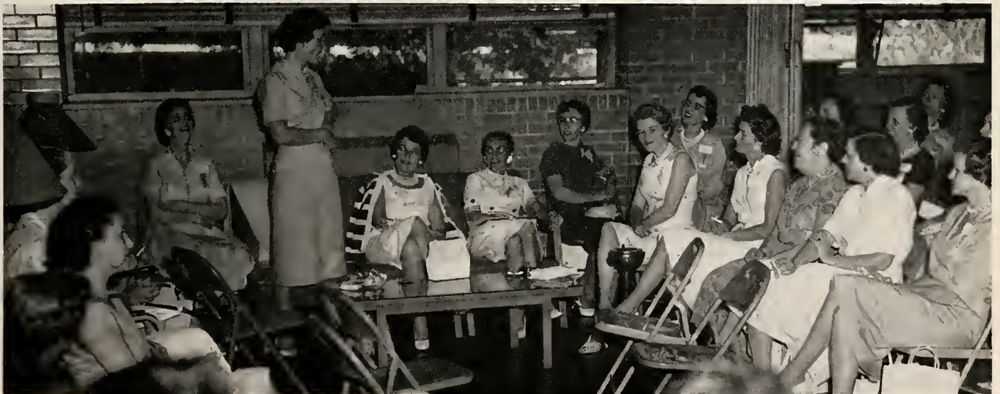
CLASS OF 1943 "in part"