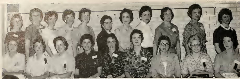
CLASS OF 1959