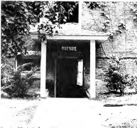
"AN OLD DOOR"