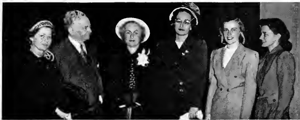
Participants in the Vocational Guidance Conference Chapel Program