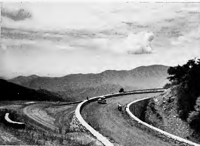
Approach to Burnsville from the Parkway

the applicant is not accepted, the $25 will be refunded.