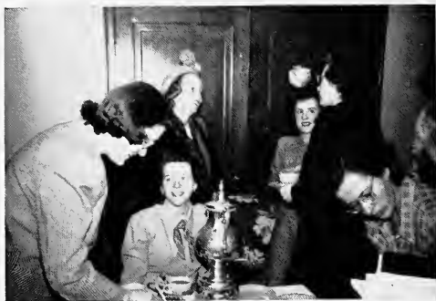
The above picture was made at the Boston Alumnae Meeting in February.