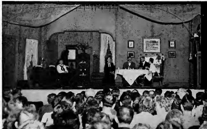
Audience enjoying scene from the bit "Years Ago"

Fees: Fees are figured at $35 per week; $100 for three weeks; or $250 for the entire eight-weeks session. This fee includes room, board, tuition, registration, and all laboratory fees. The applicant must send a $25 deposit along with the application. This sum will be deducted from the total payment due on July 1 or 2, the days of registration. If