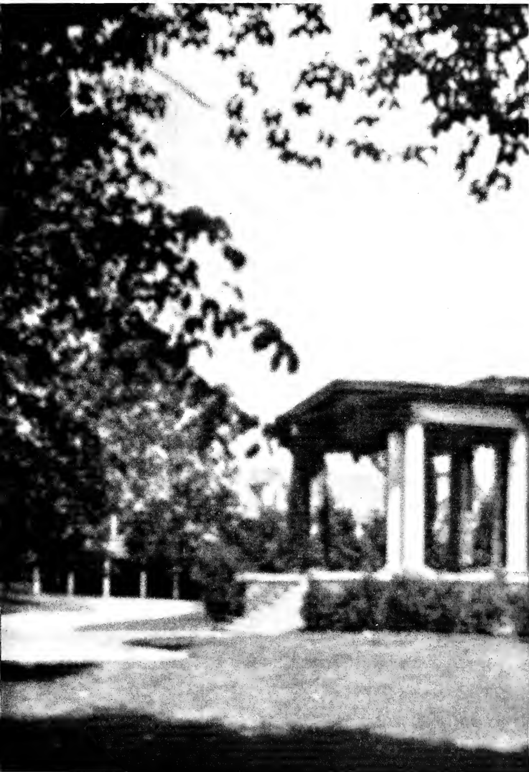
THE "RUINS" OF OLD CURRY