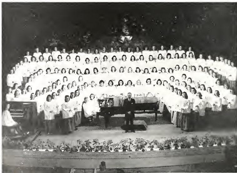
THE COLLEGE CHOIR