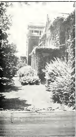
ON THE QUADRANGLE