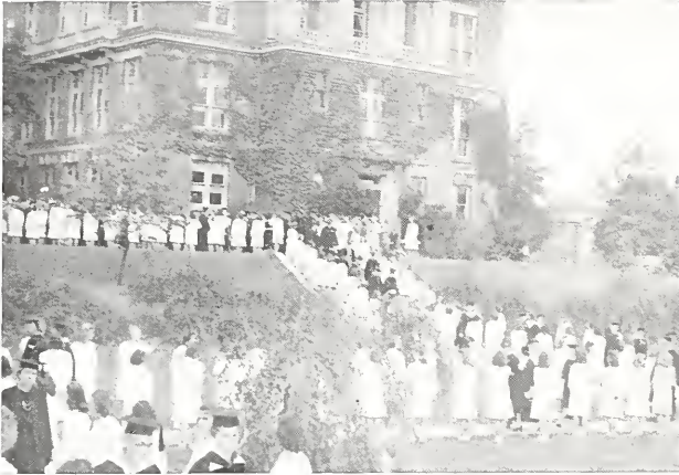
A GLIMPSE OF THE PROCESSION

the societies, the delegates from universities and colleges, the candidates for honorary degrees, the minister, the president of the Alumnae Association and the President Emeritus of the College, the Dean of Women and the President of Johns Hopkins University, the President of the University of North Carolina and the Lieutenant Commander of the Women's Reserve of the United States Naval Reserve, the Dean of Administration and the Governor of North Carolina. The whole procession, gowned, brilliantly hooded, moved between a double line of white-clad students—freshmen and commercial students, who stood at attention from College Avenue to Aycock Auditorium.