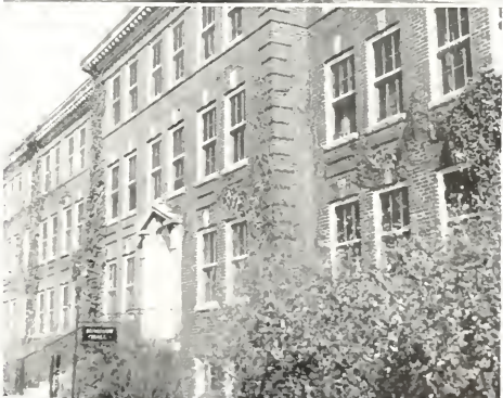
MARY FOUST HALL