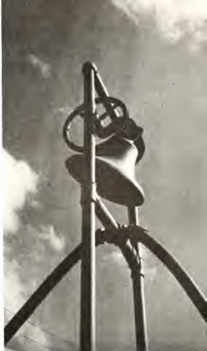
THE OLD BELL — which summoned the girls of 1892, and many succeeding generations, to classes, to meals, to chapel, to meet distinguished visitors, to hear important pronouncements. It is still here, on the campus in front of Woman's Hall, a silent reminder of old days.