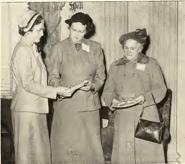
ALUMNAE OFFICERS SEE PLATES

An additional project involves landscaping in the area surrounding the new Library and the Home Economics Building, and the relocation of a driveway at the north end of College Avenue. More than a million dollars are involved in the current projects.