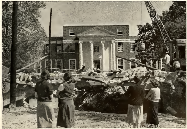
HOME ECONOMICS BUILDING

The dream of our yesterday is the measure of our present, and the hope of our tomorrow.