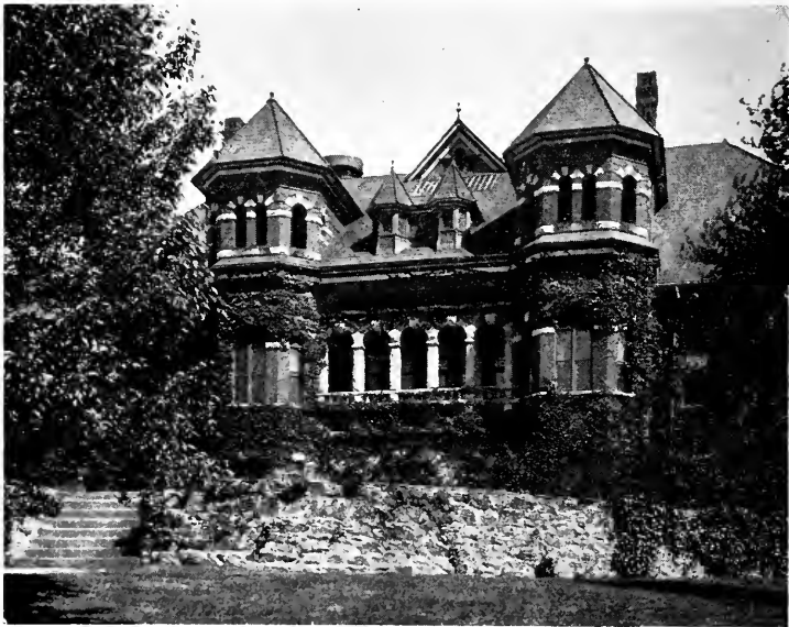
Administration Building — Now Being Remodeled

The Institute of Women's Professional Relations has issued two additional bulletins of the series planned. "Fellowships and Other Aid for Advanced Work" and "Women and the Ph.D." are the titles. Both represent comprehensive surveys on the two subjects, and contain helpful and enlightening information and material. They may be obtained from the institute, at the college, for $1.00 a copy. Other publications now in preparation are, "Home Economics Trained Women in Business," "Opportunities for College Women in Department Stores," "College Women in Banking and Investments," "Married College Women in Business and the Professions."