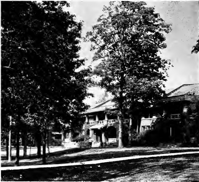
Woman's Building—Through the Trees

Within the next few years a great impetus will undoubtedly be given to the establishment of high school libraries, and the trained worker will be in demand. The college graduate who is inclined toward high school work, who likes young people, who takes the time to delve into books and realizes the joys of reading, and who would receive a remuneration similar to that of her fellow teachers, might find high school library work an interesting profession.