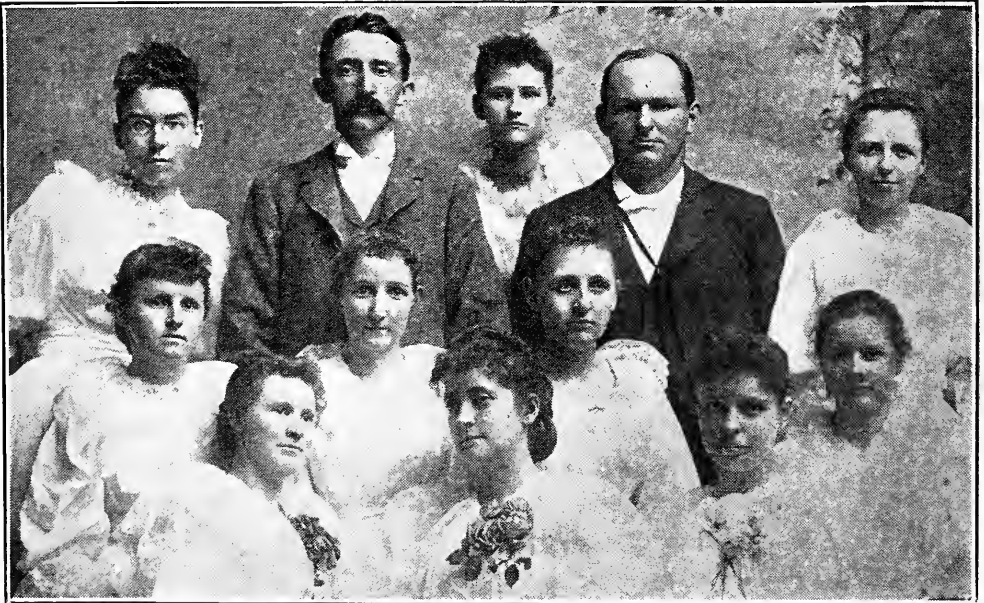
THE FIRST GRADUATING CLASS—THE CLASS OF 1893