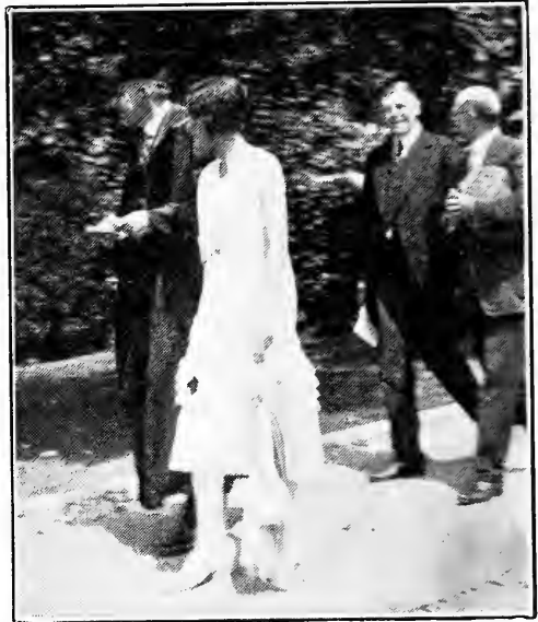
AT THE HEAD OF THE ACADEMIC PROCESSION

watch them as they received from the hands of their President their diplomas, tangible evidence that they had met the prescribed requirements of scholarship and character; and to hear with them their President's parting words of blessing.