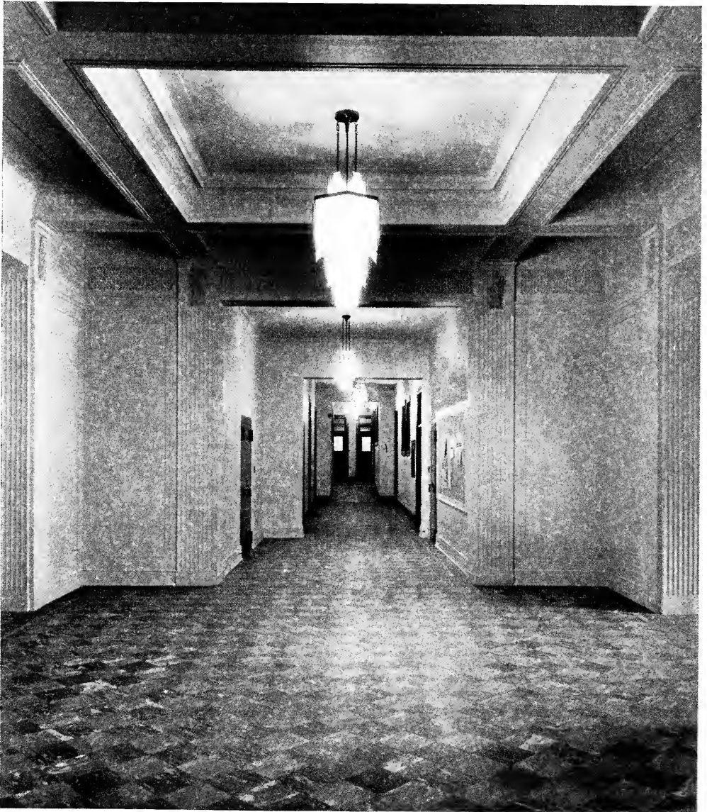
Interior view of Administration Building since it was remodeled last summer

companying this article, swallow hard, and then see if you can believe it! The outside of Administration Building remains the same: the walls and all the lines are intact, just as they always have been. From the very first alumna down to the very newest freshman, we have Administration Building, to all intents