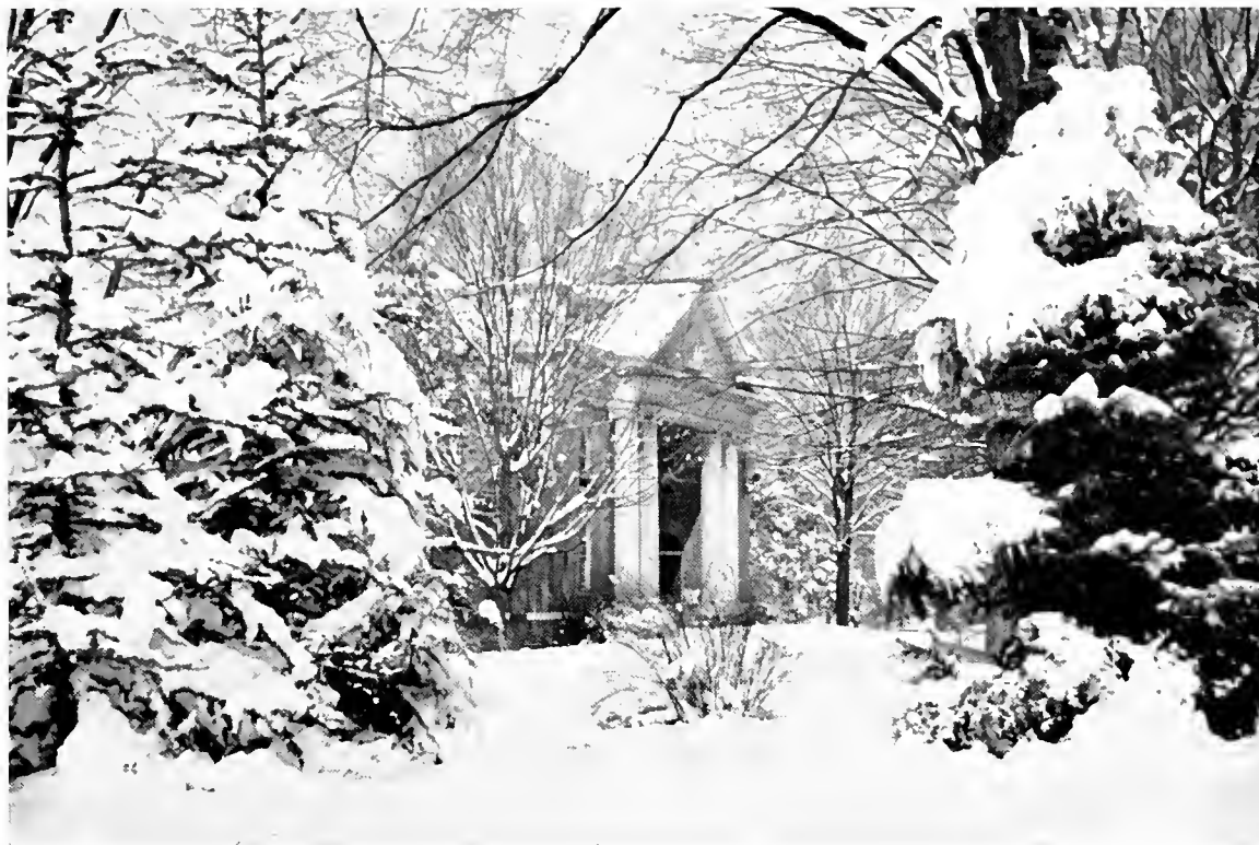
THE CHAPEL AFTER A FOURTEEN INCH SNOWFALL The Winter of 1940 Broke All Cold Weather Records in Tennessee