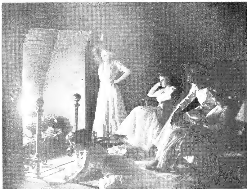
"Summon Up Remembrance of Things Past"