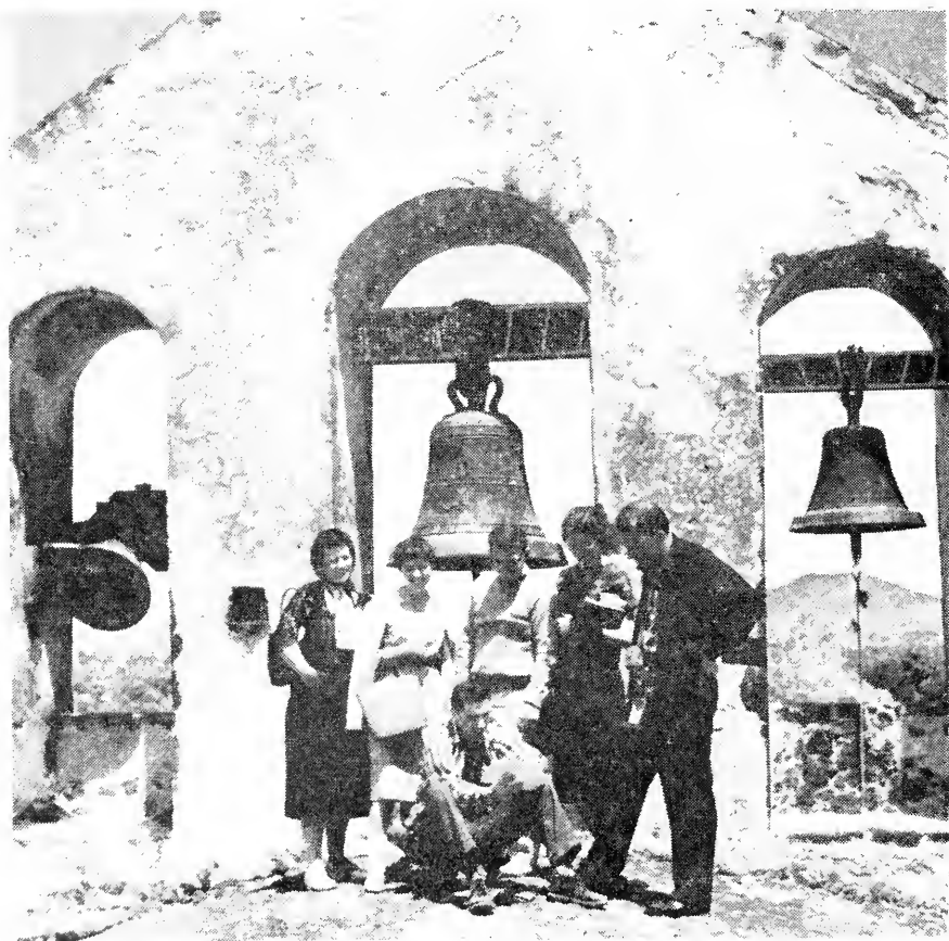
Indiana College in Mexico