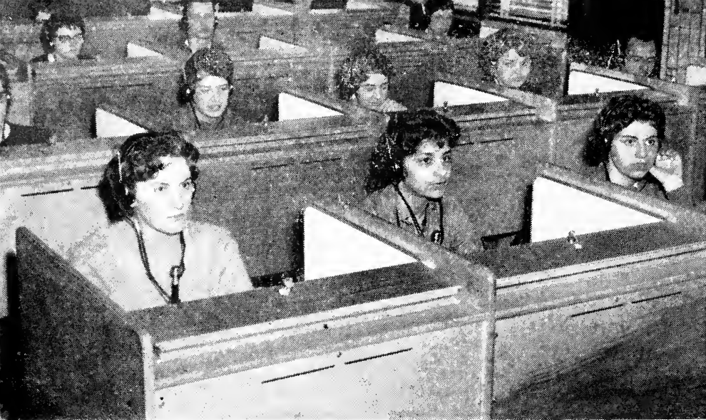
Foreign Language Laboratory at College