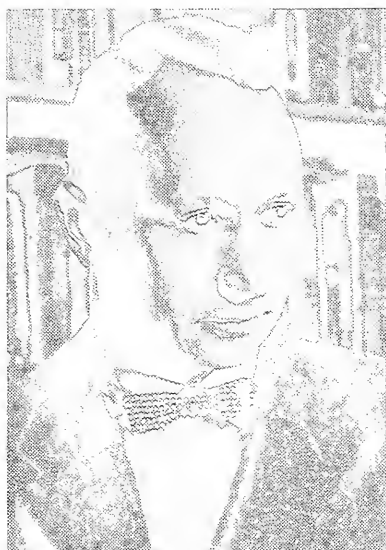
Dr. Norman Cousins