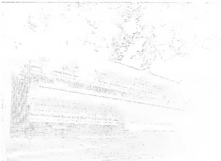
Matthew H. Walsh Science Hall

Alumni Association Bulletin Annual Giving Program Materials To Help Further Our Mission and Goals and Challenges in 1962