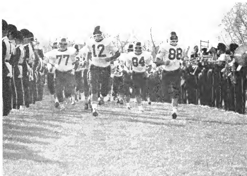
The Big Indians hit the field just before their Big Homecoming win over Clarion. Score was 34 to 0.