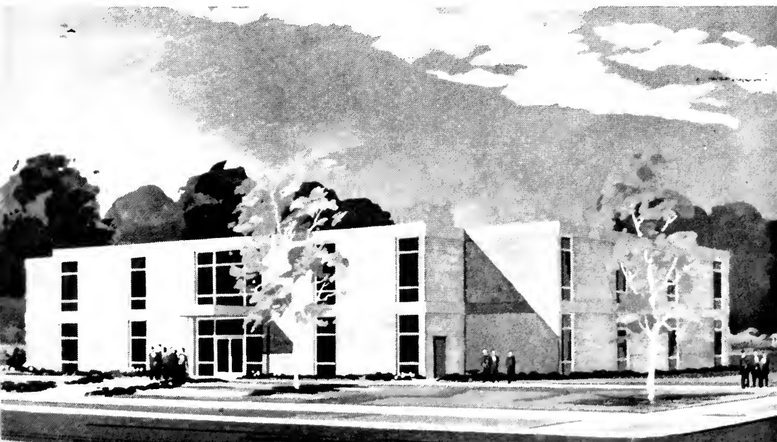
HEALTH SERVICES BUILDING PENNSYLVANIA UNIVERSITY OF PENNSYLVANIA 66A 407-30