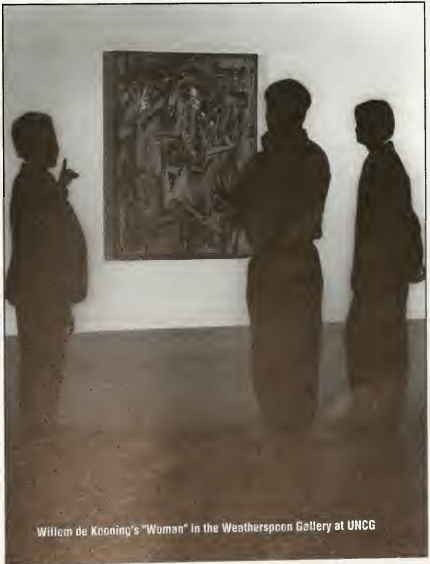
Willem de Kooning's "Woman" in the Weatherspoon Gallery at UNCG

Part of the problem might have to do with simple physiology rather than cultural determinants. Our senses are directed toward