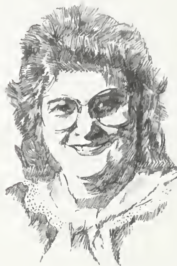
Illustration by Donna Wojek Gibbs '84