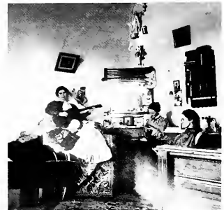
Sleeping double in a double bed was the dorm rule until 1901-02. Here, in this 1899 photo taken in Brick Dormitory, roommates entertain friends.