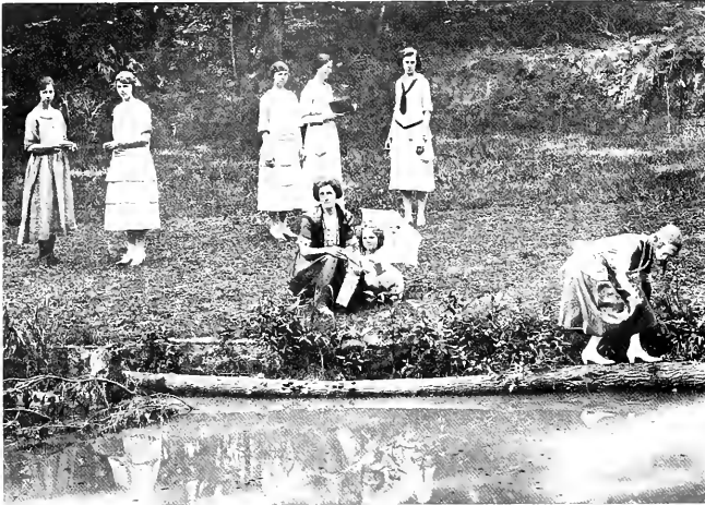
In the 1920s, Peabody Park was a favorite site for outdoor theatre. But once the site was the camping ground of Civil War soldiers and, some believe, the breeding ground of the typhoid epidemic of 1899.

We have frequently wished you might devote one of these quarterly pieces to miscellany—a sampling of little items not readily woven into a connected narrative but which, in the aggregate, provide side lights that illuminate grander themes. This time we yield to that impulse.