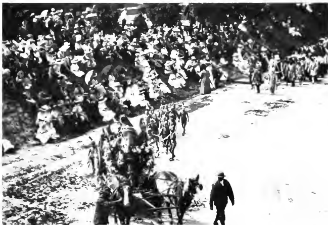
The campus has long been popular with Greensboro culture-seekers. Here crowds gather to watch the pageant scenes on May Day 1912.

In the first year, the total expense—including tuition, board, laundry, medical and physical culture fees, book fees, etc.—came to $130, including the extra $2 for a single bed. Ten years later, the figure had risen by only $10, and twenty years later the total annual bill was still under $200. After board, the largest single item was tuition: $40 in 1892 and still only $45 many years later. But the fact is that the college derived almost no revenue from this source because, by legislative prescription, any stu-