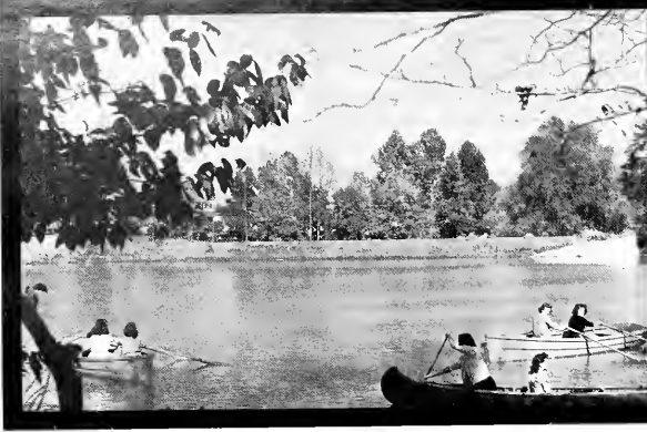
A lake, which covered part of today's golf course in the 1940's, was drained before the end of the decade. The shoreline in the background adjoined West Market Street.