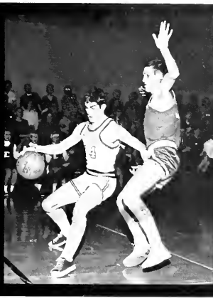
The Spartans (mens varsity basketball team) are a member of the Dixie Conference of the National Association of Intercollegiate Athletics.