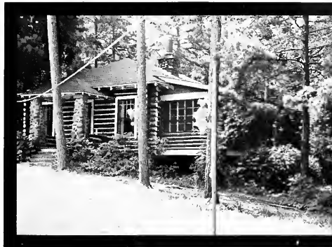
A-Hut-for-Fun, located at Guilford College, was the second college campus. Majors were required to take a three-week in-residence course in boating, canoeing and swimming at the end of the junior year.