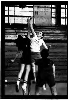
UNC-G's Girls Varsity Basketball team was a state tournament winner in 1972.