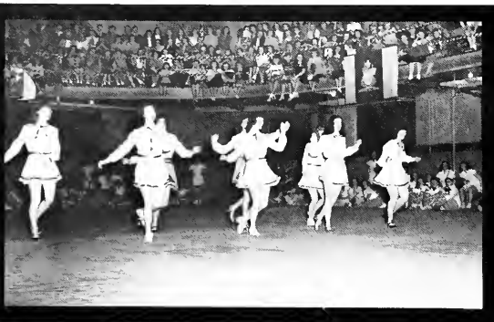
Members of the Clogging Club (1953) tap their way across the Rosenthal Gym floor during Gym Meet, an annual spring competition.

June Commencement, 1926, saw the graduation of nine Seniors with the first Bachelor of Science Degree in physical education. One of these graduates wrote reminiscing about her class,