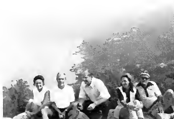
Alumni tourists in the western section, en route to Mount Torrent.