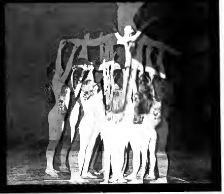
The dance program, an important part of the School's program since its earliest days, will be featured in a subsequent issue of The Alumni News.

university teaching. Of the total available graduates of the Department, there is a 100 percent placement record."