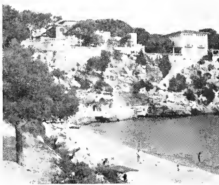
Shoreline view at Porto Cristo on the eastern end of the island.