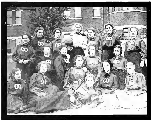
The Naughty-Naught was the senior basketball team of the year that turned the century. The Athletic Association was organized two years earlier.