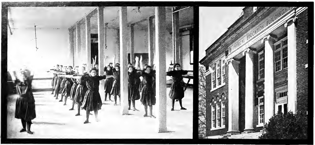
The basement of South Spencer served as "gymnasium" for education classes until 1925 when Rosenthal Gymnasium was completed. Today Rosenthal houses an Olympic-size pool and the Rosenthal Research Laboratory, an expanding part of the School's program.