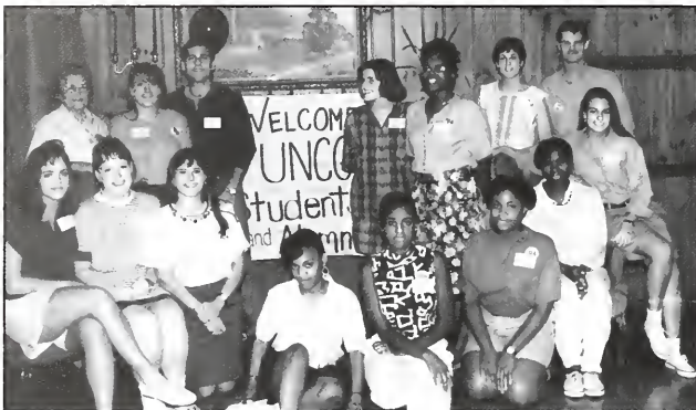
Charlotte alumni hosted a Send-Off Party for Mecklenburg County students just before school opened.

Remember how apprehensive you felt during the summer before you left for college?