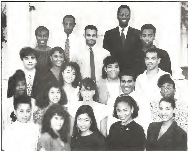
The participants in the 1990 Human Development Research Institute.