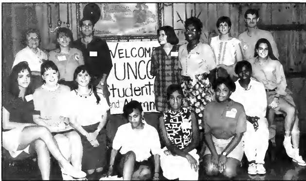
Charlotte alumni hosted a Send-Off Party for Mecklenburg County students just before school opened.

Remember how apprehensive you felt during the summer before you left for college?