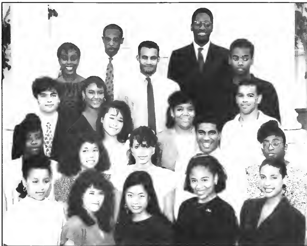
The participants in the 1990 Human Development Research Institute.