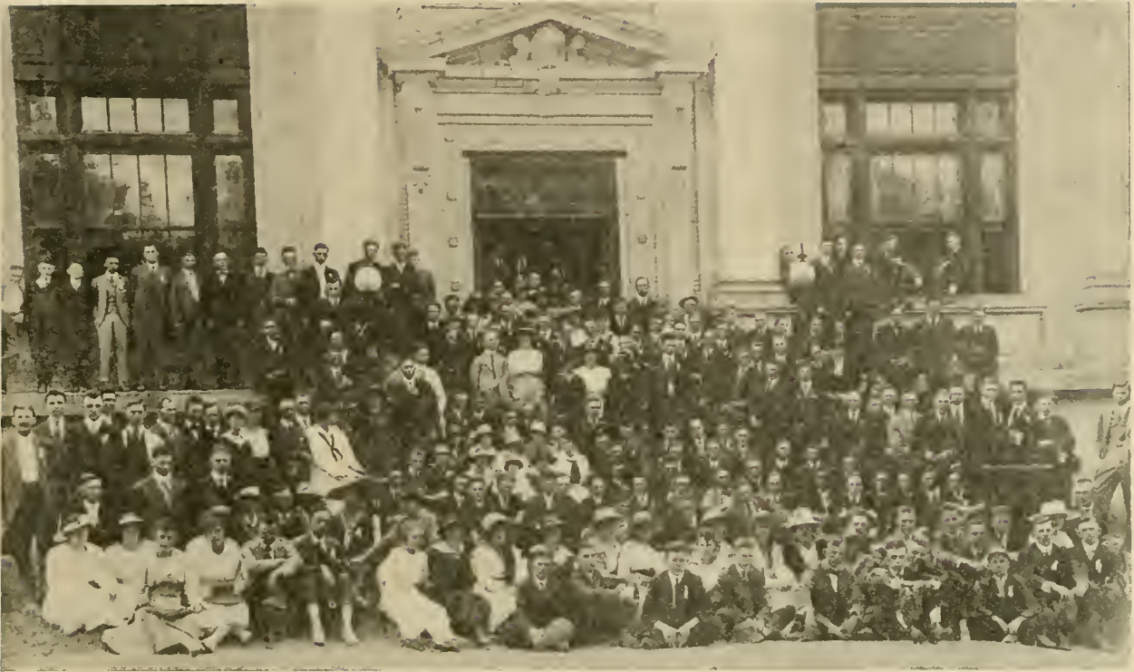
GROUP OF DEBATERS, TEACHERS AND ATHLETES ATTENDING HIGH SCHOOL WEEK AT THE UNIVERSITY

was the closing exercise in the program of entertainment.