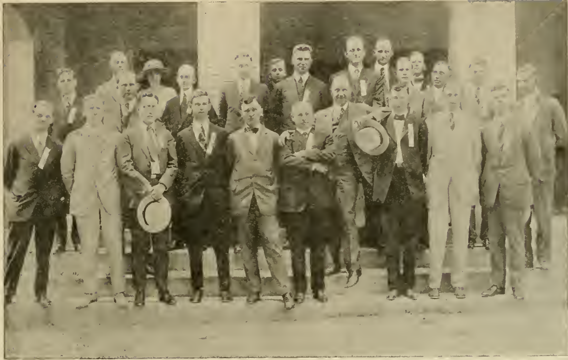
1908 CAME BACK WITH 29 MEMBERS AND $1,000