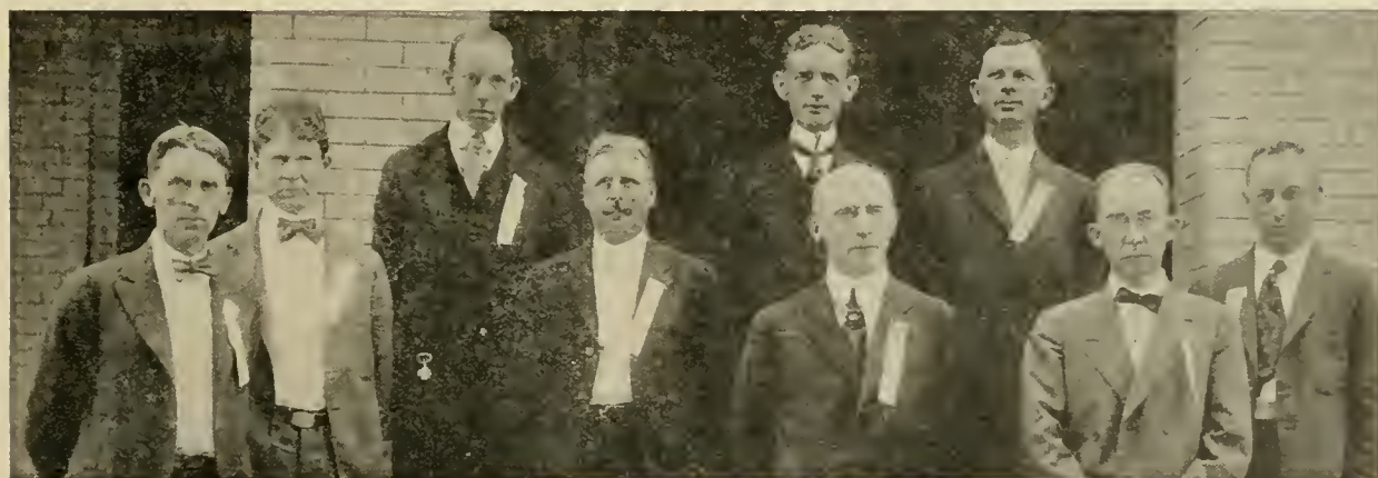
THE CLASSES OF 1858, 1868, 1893, AND 1898 BACK FOR REUNION