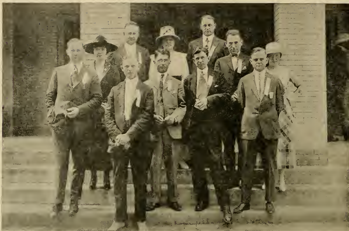
REPRESENTATIVES OF THE CLASS OF 1903

Christ suffered. Be yourself just as thoroughly as you possibly can be."