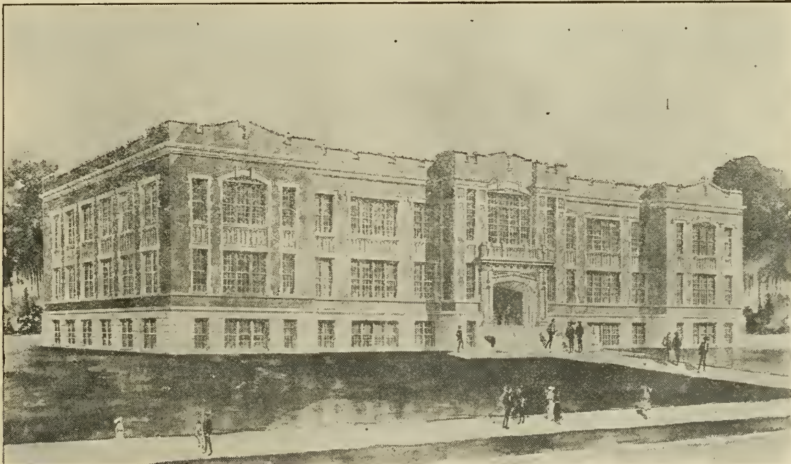
$125,000 ENGINEERING BUILDING NOW BEING ERECTED

I am fairly busy now with work that is interesting in spite of its gruelling nature, because it shows me so many types of American citizens. I am training recruits by a system that designs to fit them for duty in replacing casualties in organizations already