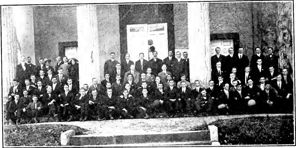
DEBATING UNION CONTESTANTS

After the awarding of the cup, a reception was tendered all of the visitors in the Y. M. C. A. building.