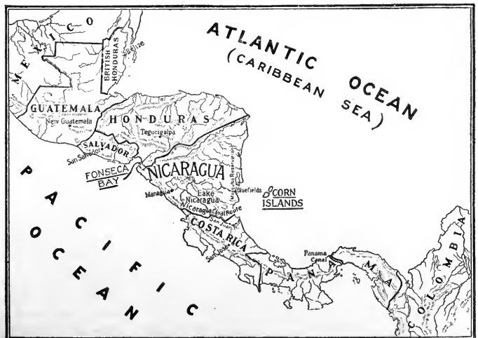
THE REPUBLIC OF NICARAGUA IN ITS RELATION TO OTHER CENTRAL AMERICAN COUNTRIES

The five republics of Central America, of which Nicaragua is one, have been the scene of probably more revolutions in the past hundred years than any other region of equal area in the world. If the Central American countries alone were to be considered, one might indeed keep "hands off," and let them "stew in their own juice."