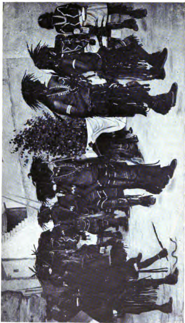
HOPI SNAKE DANCE