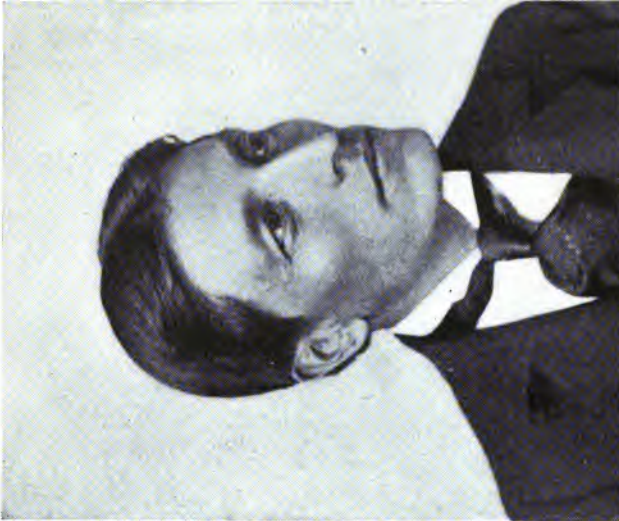
On leaving Carlisle