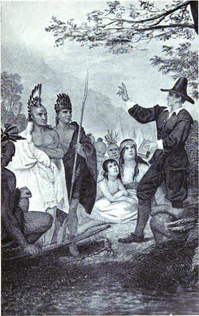
JOHN ELIOT Preaching to the Indians