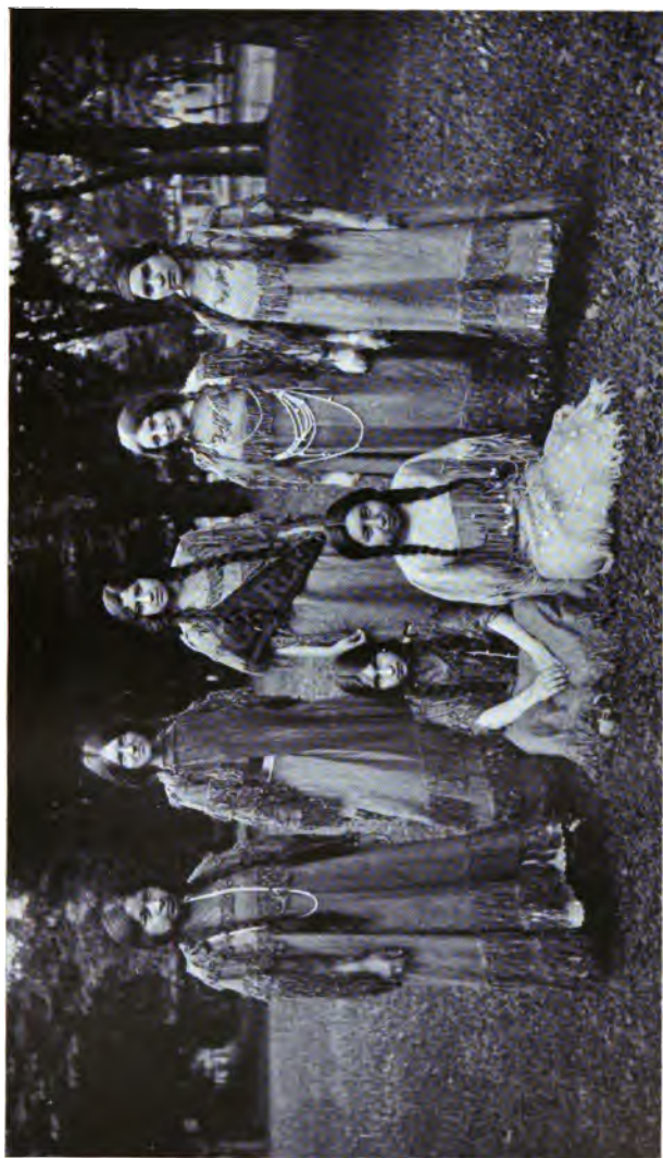
CARLISLE GIRLS AT Y. W. C. A. CONFERENCE