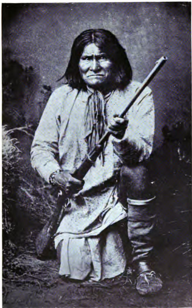
GERONIMO, APACHE CHIEF Christian Convert