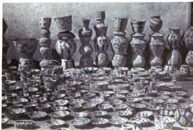
PIMA BASKETS PAPAGO BASKETS