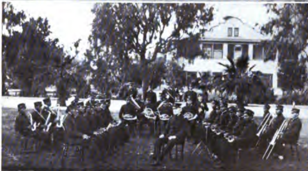
SHERMAN INSTITUTE, RIVERSIDE, CALIFORNIA Government School