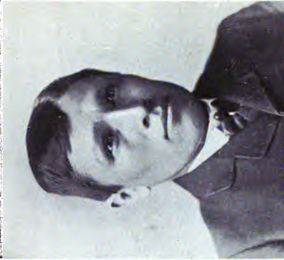
On leaving Carlisle