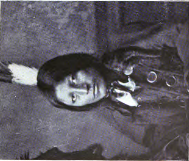
Before entering Carlisle