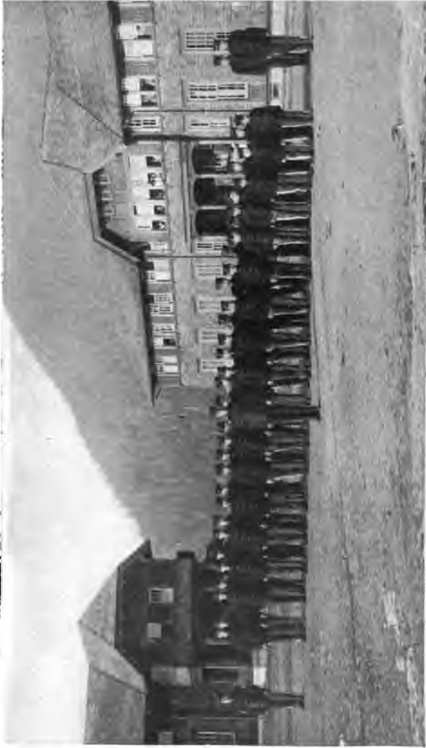
BOYS OF SHELDON JACKSON SCHOOL IN THEIR UNIFORMS