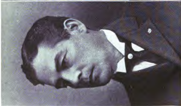
Robert S. Owen U. S. Senator.