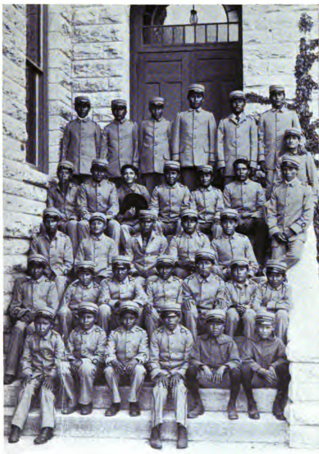
NAVAJO BOYS AT CHILOCCO SCHOOL