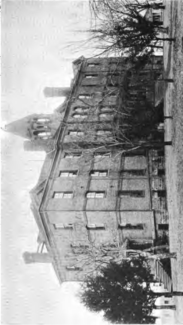
BACONE COLLEGE One of the Important Buildings