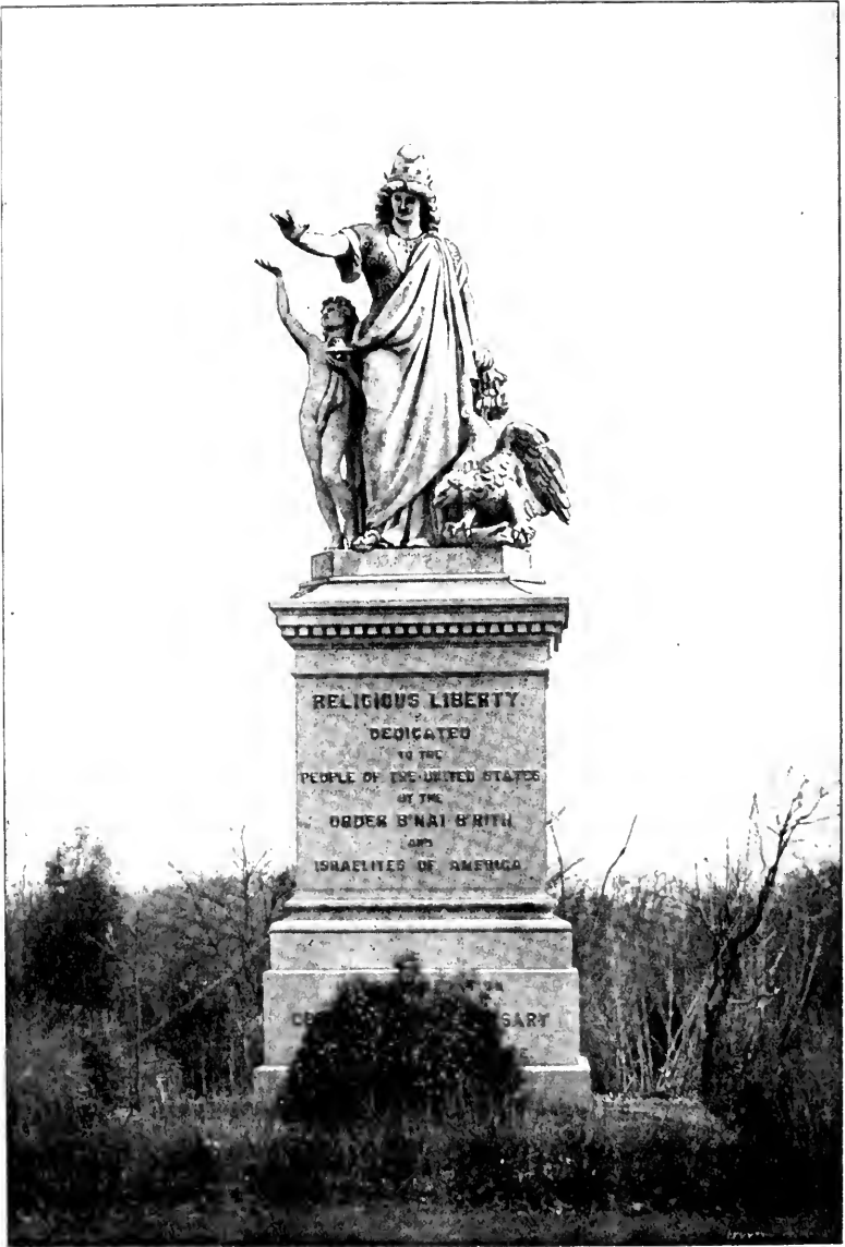
STATUE OF RELIGIOUS LIBERTY, Fairmount Park, Philadelphia.