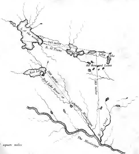
No. 2 Contains 32400 square miles