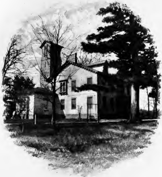
The Home of Martin Van Buren