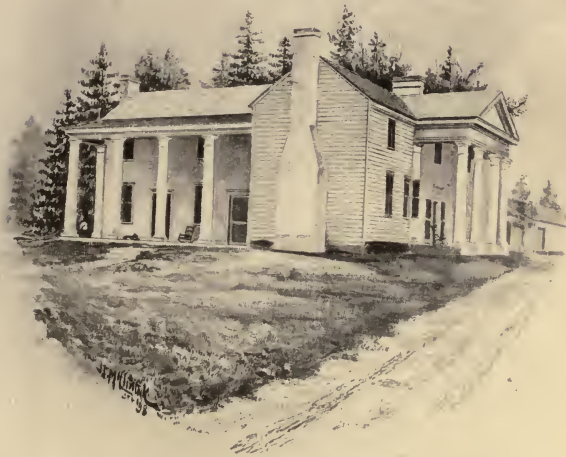
The Home of John C. Calhoun