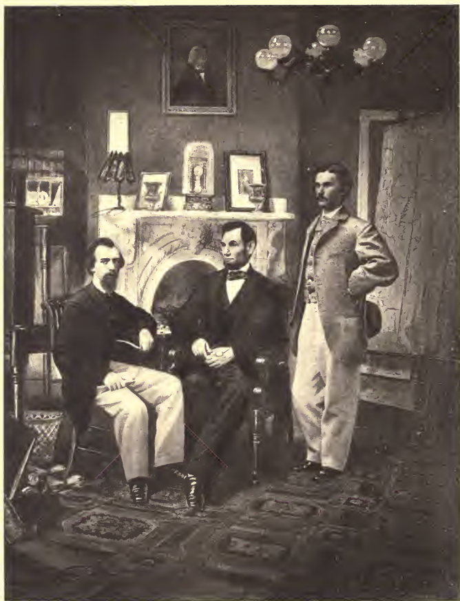
Lincoln and his Secretaries. Nicolay and Hay