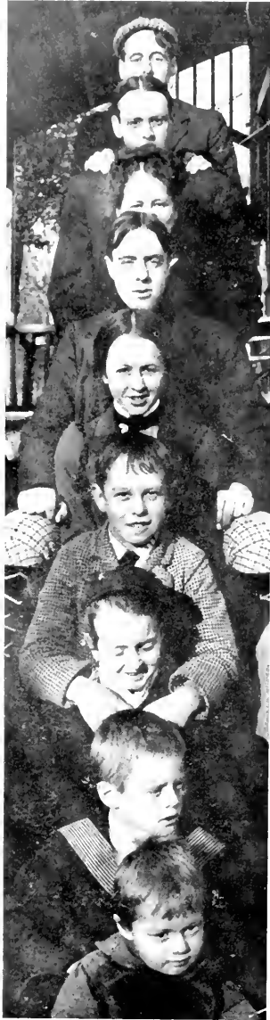
THE NINE SPRINGS Christmas, 1900