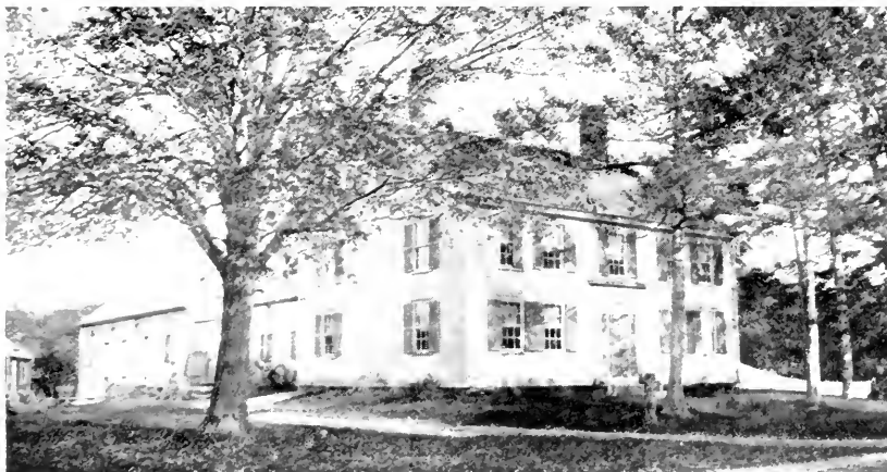
RESIDENCE OF MOSES BATCHELDER

Built in 1837 on site of the old Batchelder mansion