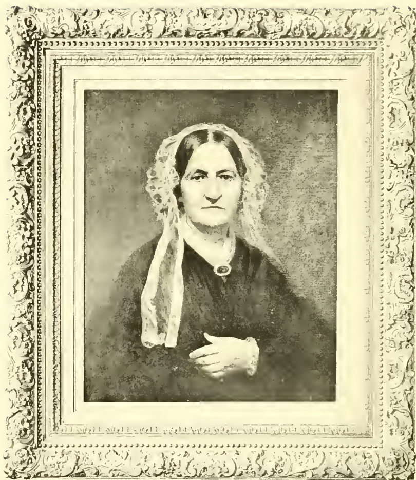
ELECTA TUCKER GREENLEAF. 1791 — 1864 Portrait by Wm. A. Wheeler.