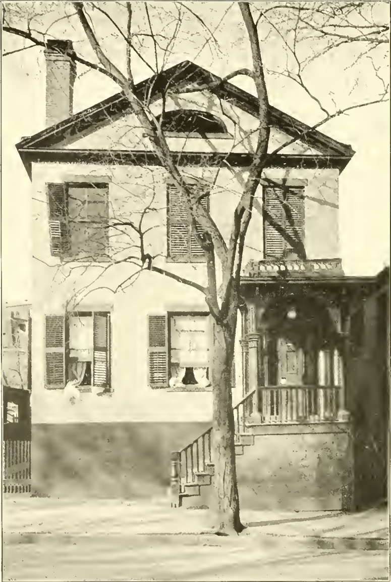
THE GREENLEAF RESIDENCE, NO. 10 WINDSOR ST., HARTFORD.