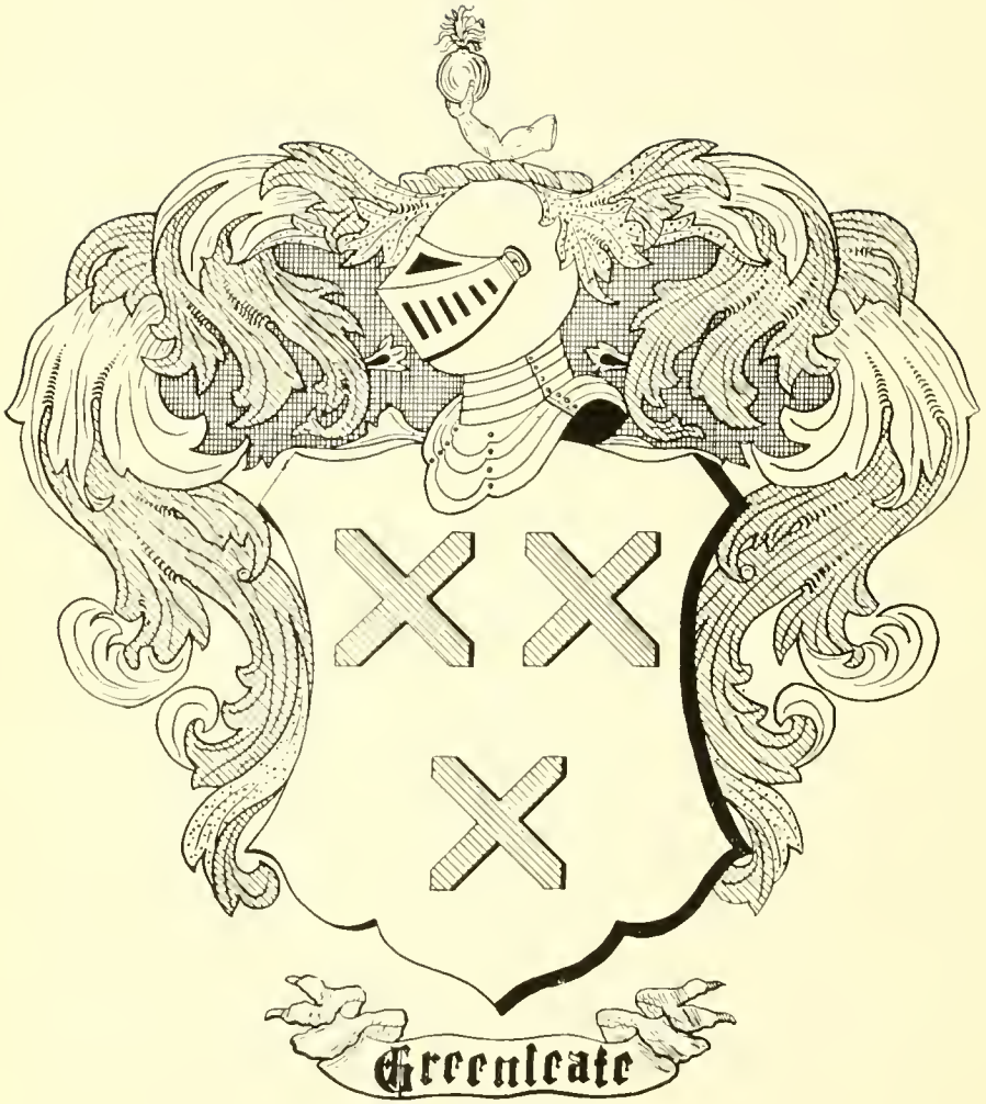
GREENLEAF COAT OF ARMS.