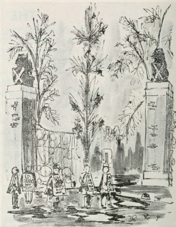
A dream come true: "Unfair to Schoolboys"? No, just the Steelworkers!