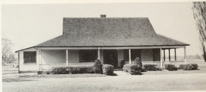
The Tuck Shop, which is to be moved to a new location. The Auditorium and Classroom Building will be constructed on this site and the Great Hall to the south-west of it.