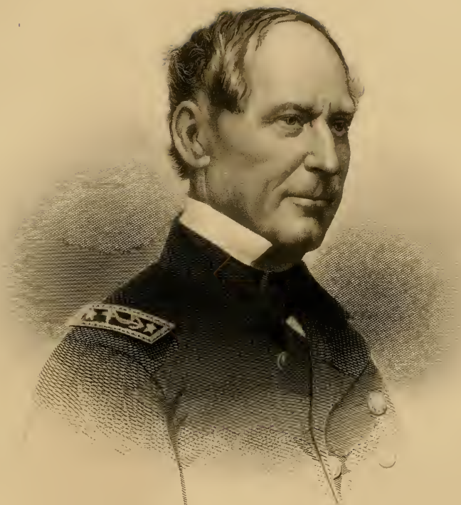
ADMIRAL D. G. FARRAGUT