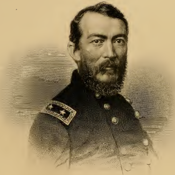
Fig. 57. H. P. H.