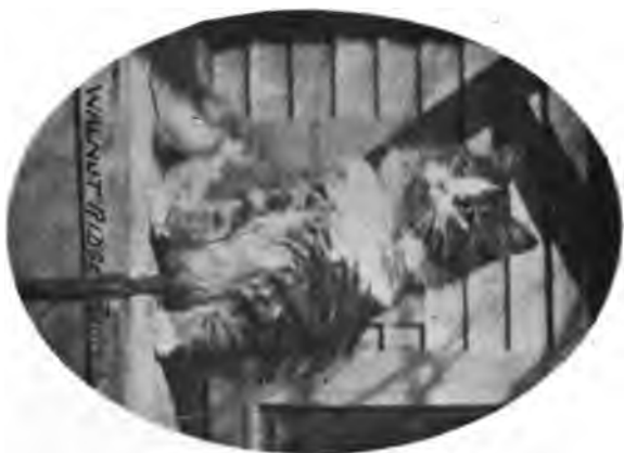
TIGER AND WHITE KITTEN.