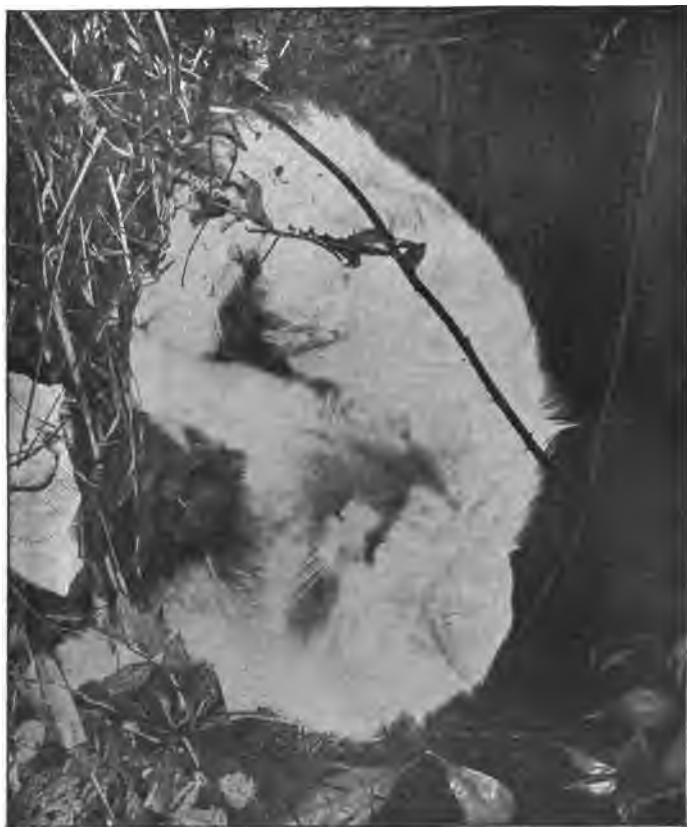
A WHITE ANGORA. "AS PLAYFUL AS A KITTEN."