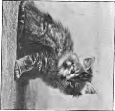
TIGER KITTEN. 8 WEEKS OLD.