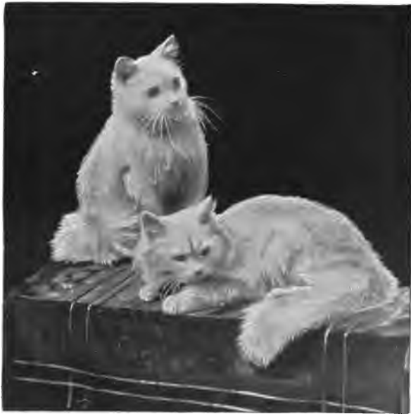
PAIR OF WHITE KITTENS.