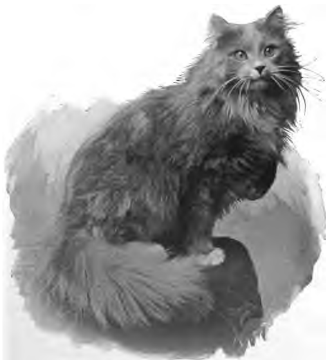
MALTESE MALE CAT.