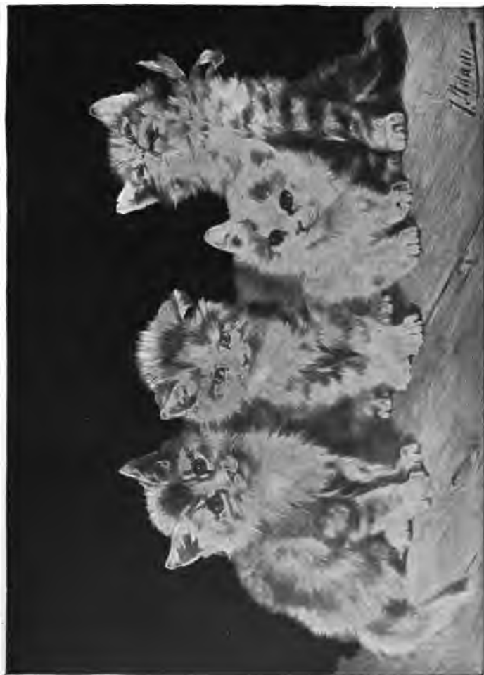
LOT OF ANGORA KITTENS.