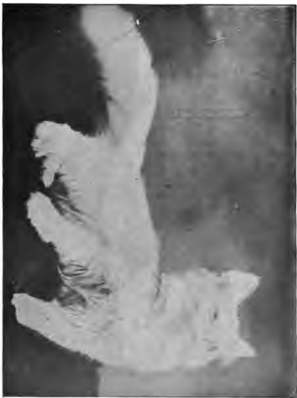
PURE WHITE MALE "ROLAND," ONE EYE BLUE, THE OTHER RED.