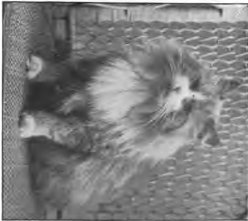
BLUE AND WHITE. 10 WEEKS OLD.