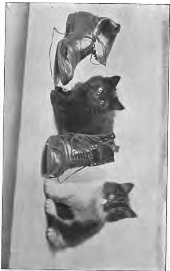
"PUSS IN BOOTS."