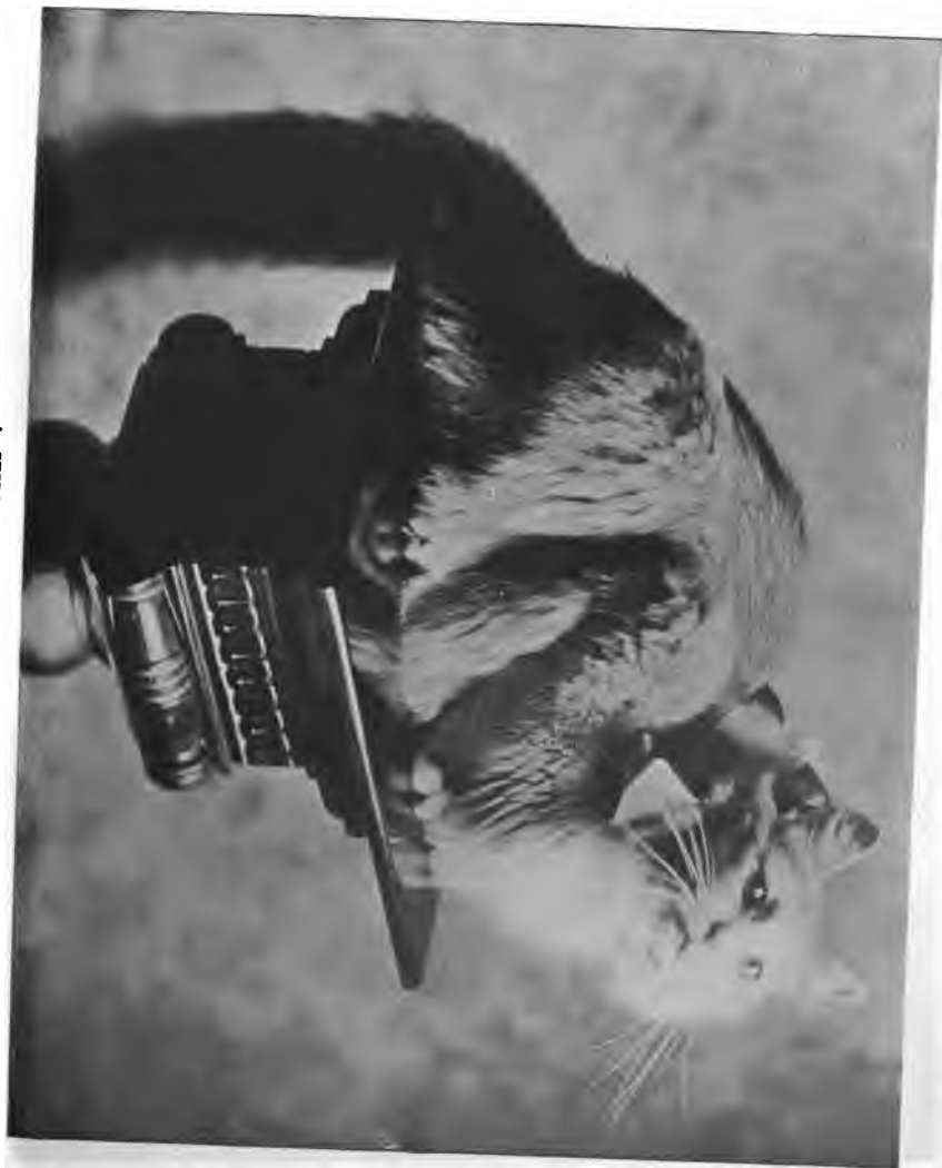
A KING ROYAL CAT.