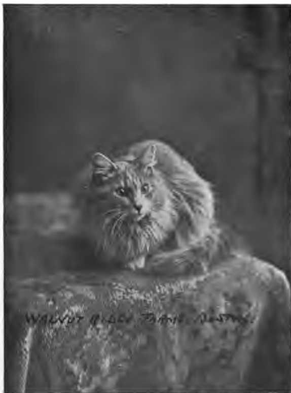
BLUE MALTESE MALE.