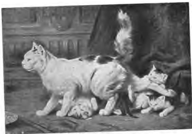
A MOTHER AND FAMILY.