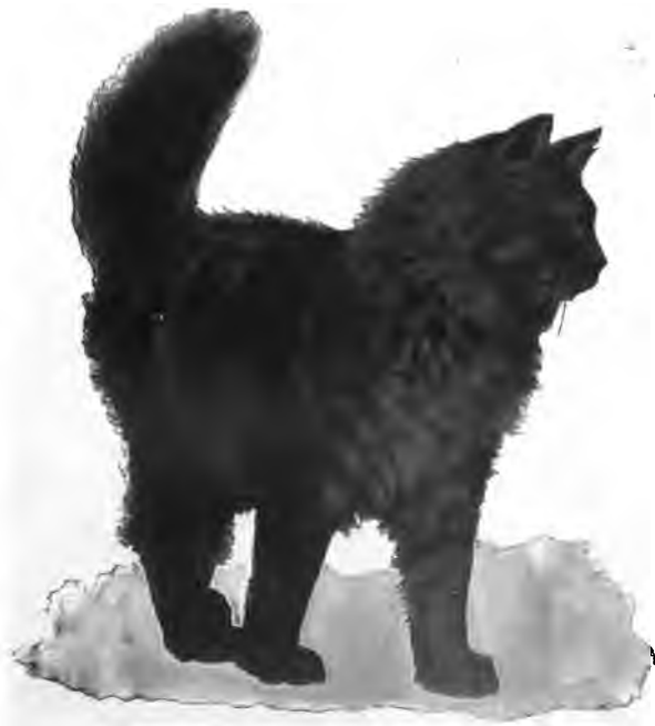
BLACK KITTEN — BARRED.