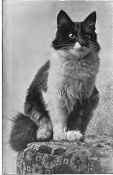
BLACK AND WHITE MALE.