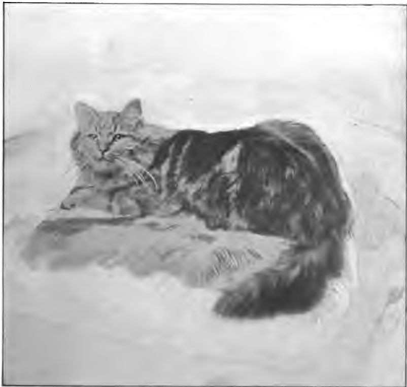
MAHOGANY BUFF MALE.