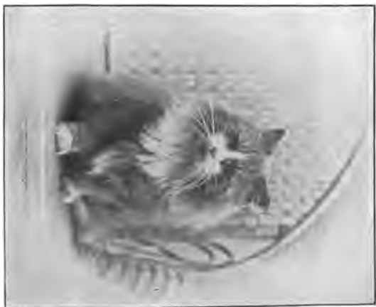
GREY AND WHITE KITTEN. 8 WEEKS OLD.