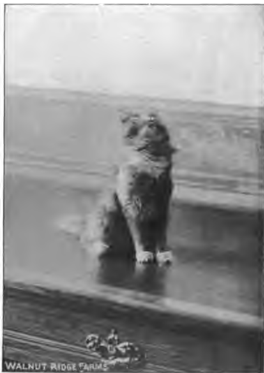
BLUE AND WHITE.