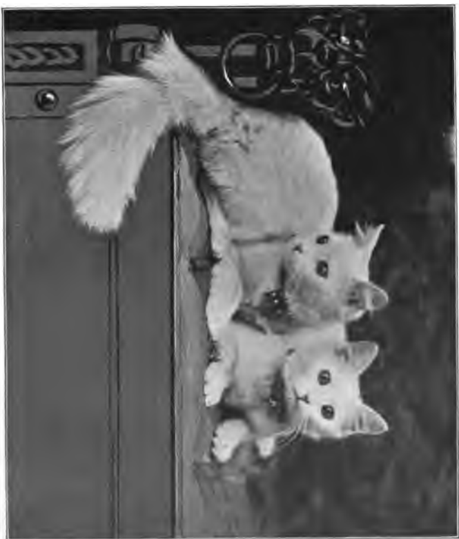
PAIR OF WHITE KITTENS. 7 MONTHS OLD.