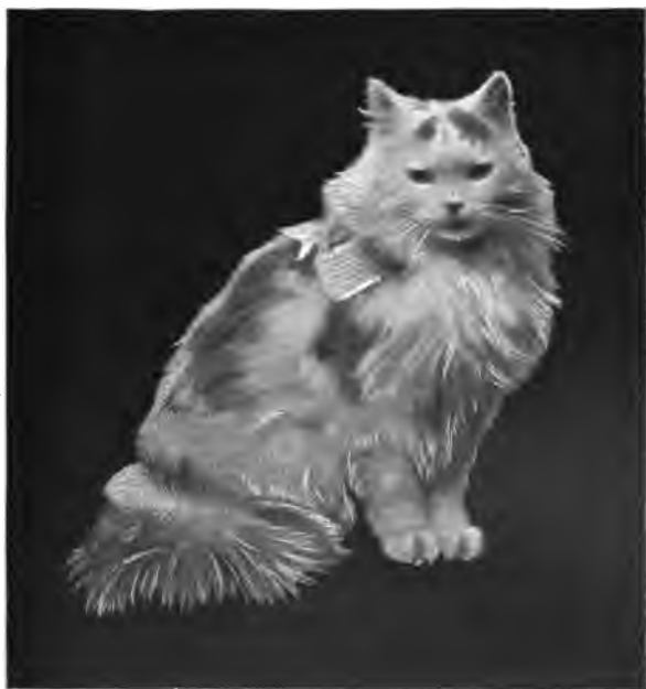
WHITE. WITH BUFF SPOTS.