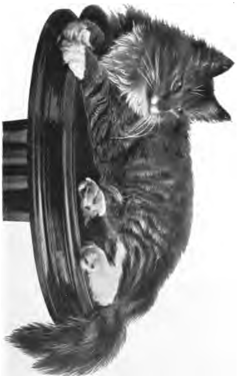
TIGER AND WHITE MALE. WEIGHT, 16 LBS.