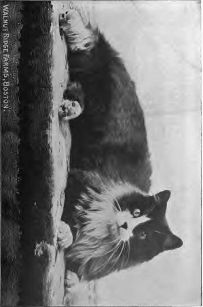
BLACK, WITH WHITE BREAST AND POINTS. AGE, 2 YEARS; WEIGHT, 18 1-2 LBS.