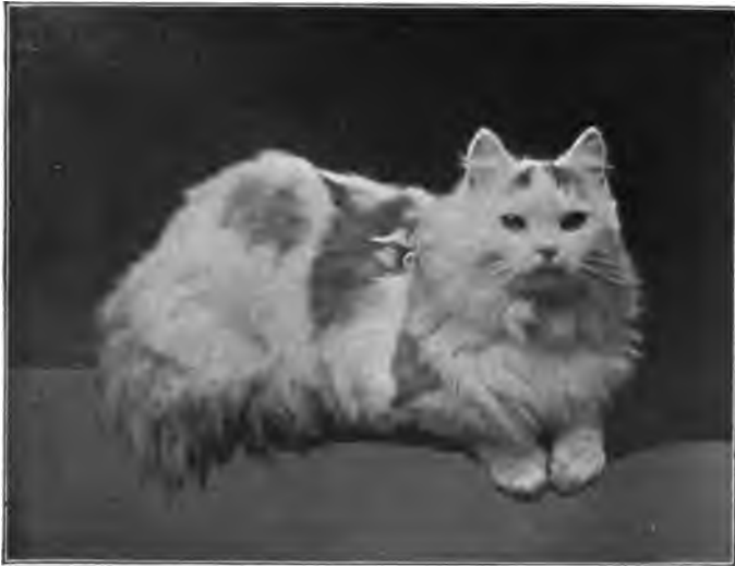
WHITE, WITH BUFF SPOTS.