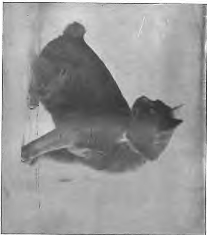
FIRST PRIZE MANK CAT. OWNED BY OAKLAND FARM.