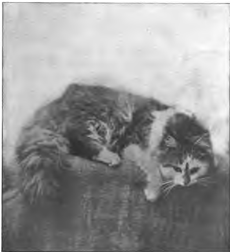
GREY AND WHITE MALE.