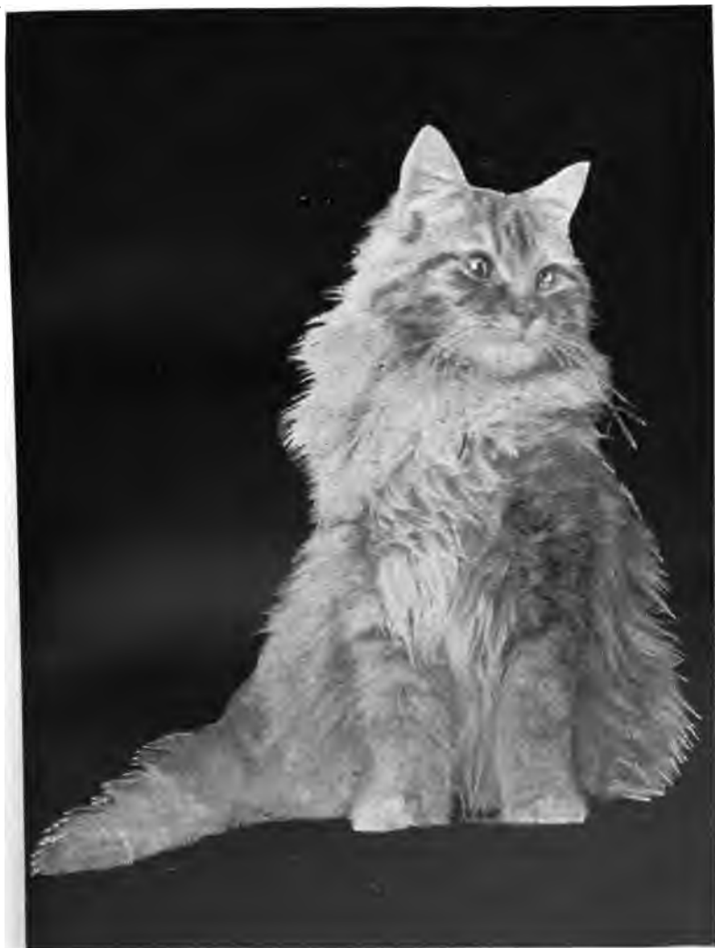
SILVER BLUE KITTEN.