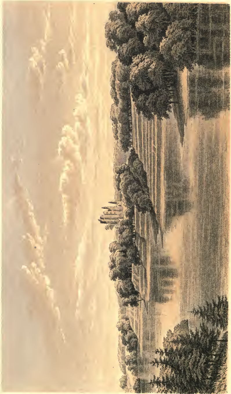
UPPER WATER - GREAT BURNING