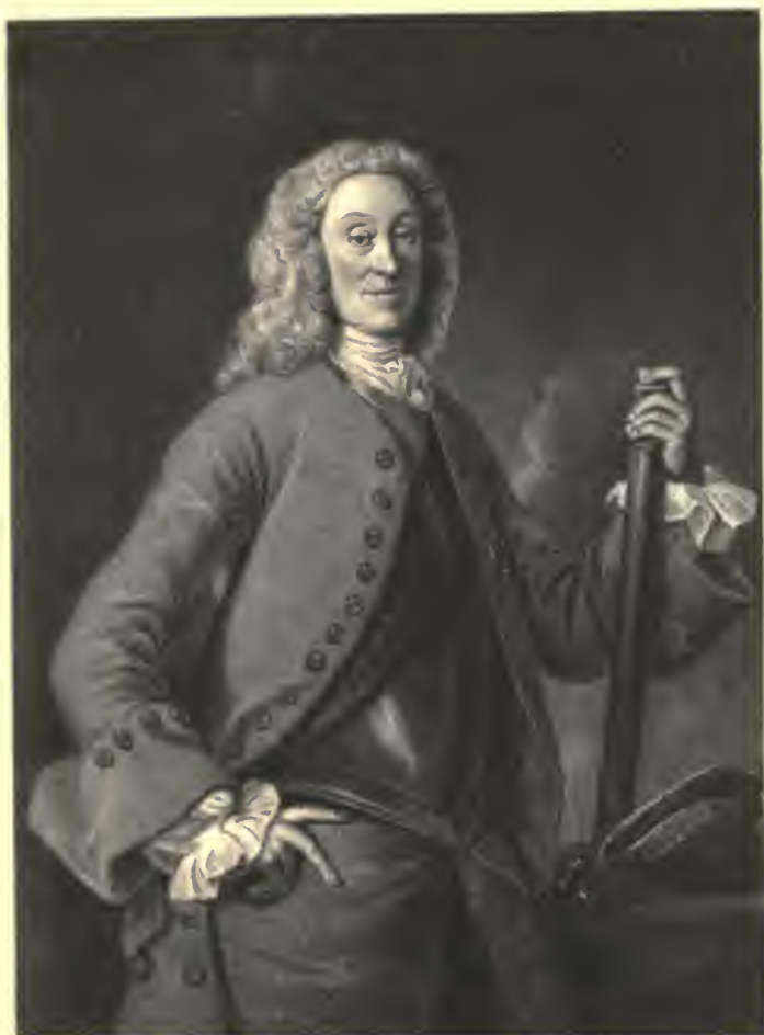
JOHN DALRYMPLE, ESQ. SECOND EARL OF STAIR, &c. FIELD-MARSHAL OF THE FORCES, &c. &c. &c.