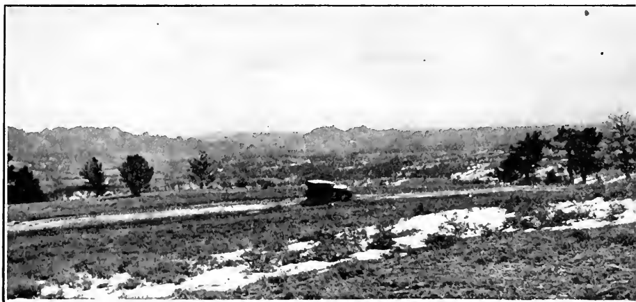
Highest point on Lincoln Highway looking east