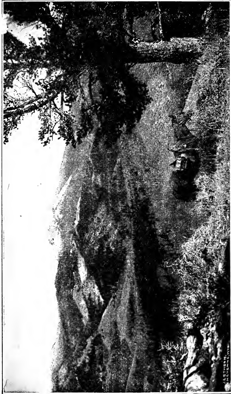
ELK MOUNTAIN IN CARBON COUNTY