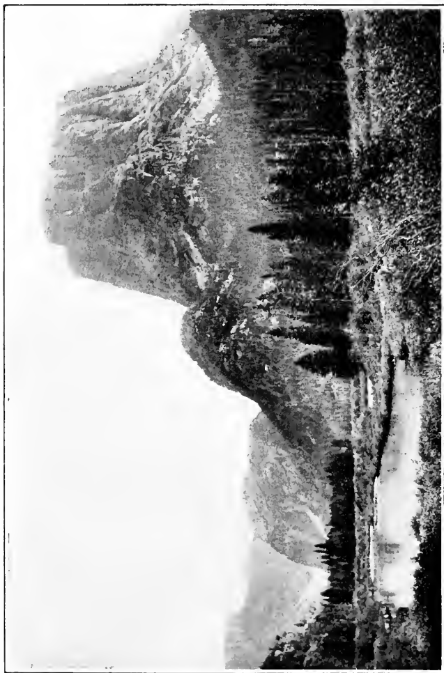
In the Valley of the Green River