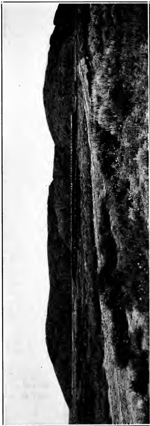
Independence Rock, Showing New Bridge Over the Sweetwater River and the Oregon Trail.