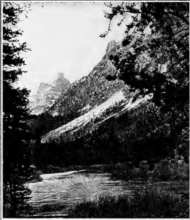
A Scene on West Fork of Wind River, Fremont County