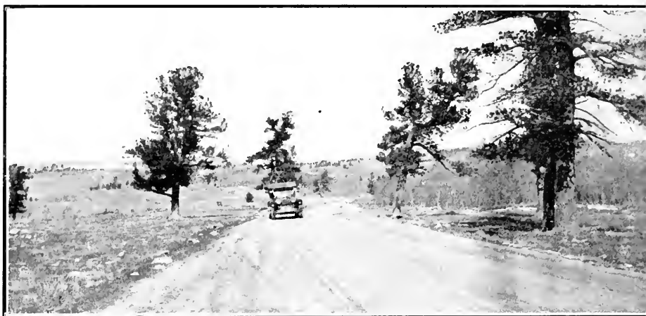
Lincoln Highway just west of summit of Sherman Hill looking west