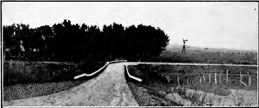
Midway between Cheyenne and Torrington on road to Torrington, on Oregon Trail