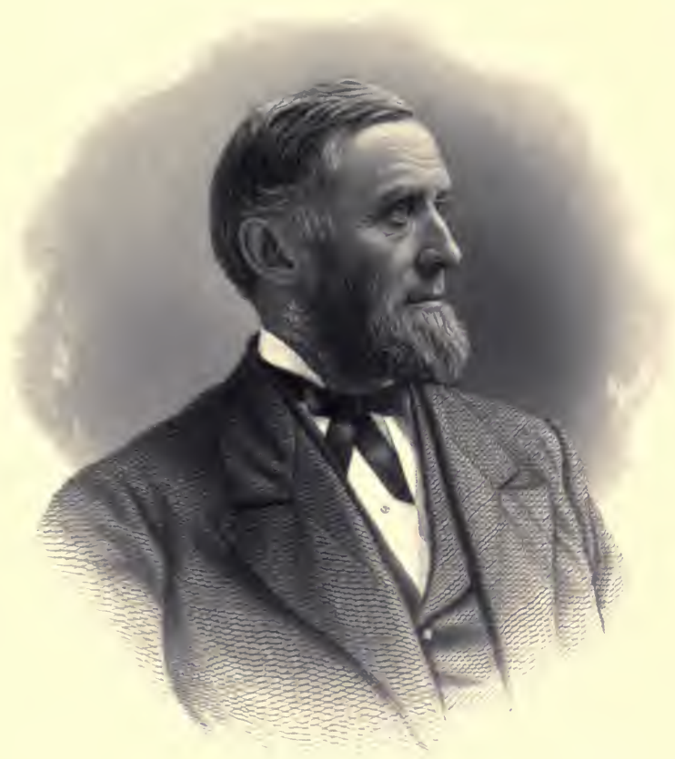
Charles Carleton Coffin