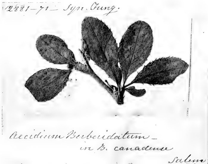
FIG. 1. From a photograph of the mounted specimen in the Academy of Natural Sciences of Philadelphia, basis of Schweinitz's No. 2881. Each specimen in the mounted set is treated essentially in the same manner. The writing was done by Michener. Engraved full size.

Represented by a mounted specimen of a stout, ash-gray stem, 3.5 cm. long, having two fascicles of leaves, two full-grown leaves in one fascicle and three in the other, each leaf 1.5 by 3 cm. or somewhat less, bearing a number of small groups of young æcia, one group only appearing mature (see cut). There is also an empty