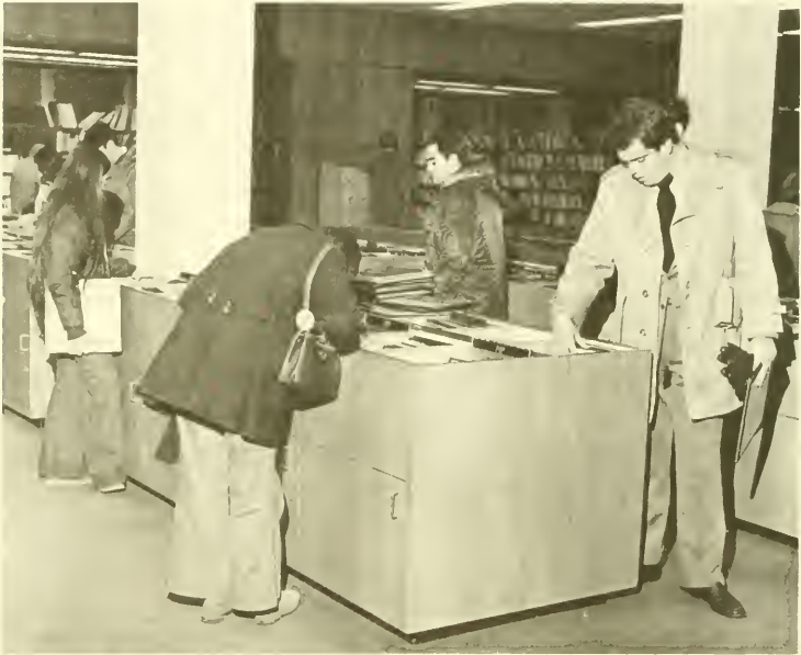
Visitors to the Audio Visual department in the General Library.

The Committee is puzzled by the limitations on book acquisition entailed by the "Domestic Order List" and "Inspection Room" systems of book ordering used by the Library. Although the latter recently has been enlarged, the Committee feels that every effort should be made to make the process of book ordering for the staff as easy and efficient as possible.