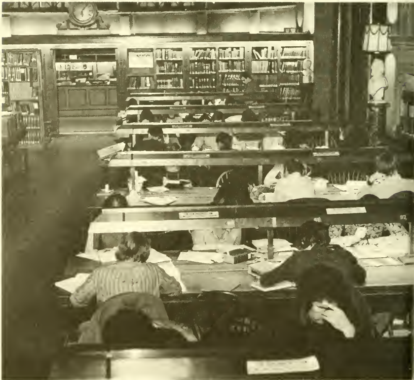
Bates Hall, the main reference room in the Research Library.

The recent increase in staff levels might make it possible for the Print and Rare Book Departments, both closed on the weekends, to be open on Saturdays. (The Rare Book Department was open on Saturdays until 1972; the Print Department has not been open on weekends for at least the past twenty years.)