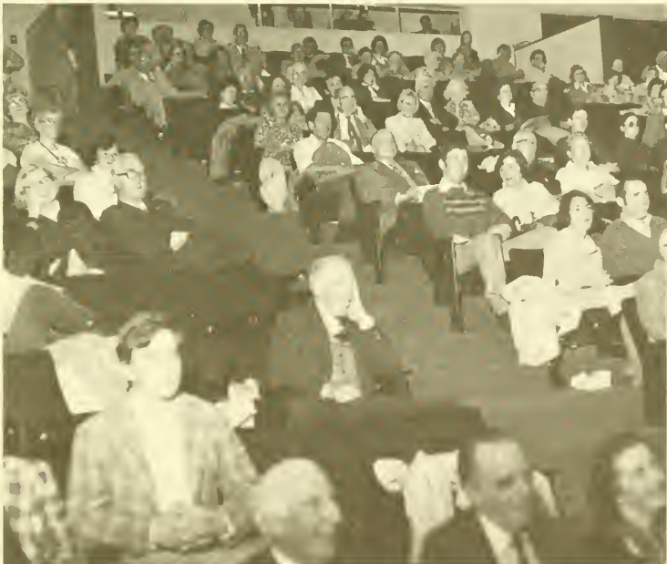
"Education in Ireland Today," typical of the many programs held each year in the Rabb Lecture Hall.

From its inception in the mid-nineteenth century the Boston Public Library has been supported generously almost in its entirety by the taxes appropriated from the residents of the City of Boston. From its inception, also, it has been intended and