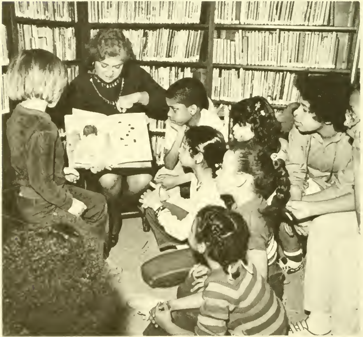
One of the popular reading programs for children in the branch libraries.

Adequate specific budget for books, periodicals, and maintenance for each library; Staff room and lavatory; Public rest rooms; Room for community programs; Access to trust funds earmarked for a particular branch; Appropriate foreign language books in each branch, i.e., Cambodian, Vietnamese, Spanish, and Italian; High quality photocopiers with a service repair policy; Community bulletin boards; and Preservation and display of gifts presented to a particular library.