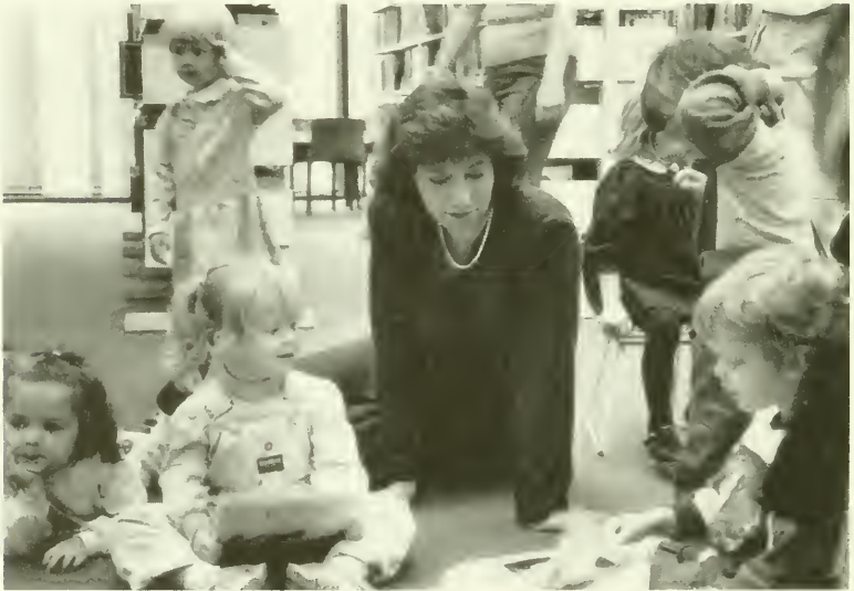
Discovering the world of books.

In a sampling of the activities which compelled the attention and delight of young people, children at Adams Street played BOOK BINGO; Charlestown sponsored Creative Drama during the summer; Brighton held After School Stories and Films; Egleston, Faneuil, Fields Corner, and Jamaica Plain held Toddlers Story Times; Hyde Park held an all-day Trick or Treat; Lower Mills and North End sponsored Puppet Shows; Codman Square and Fields Corner held animal programs featuring guests (human and animal) from the MDC Traveling Zoo and Franklin Park; Egleston Square featured thematic Pirates Day and Detectives Day, also a Teddy Bear Picnic; North End held Story Hours for Mothers and Toddlers, and West Roxbury conducted Pajama Story Hours. Book-related craft programs were frequent: kitemaking and