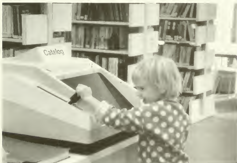
A young expert in information retrieval.

The Government Documents Department received a major bibliographic reference tool, a CD ROM (compact disk, read only memory) U.S. Government Publication Catalog , by which the public can view on a monitor data related to government publications since 1976 (updated monthly). A laser jet printer, also acquired this year, makes it possible for public and staff to print out the data they have rapidly retrieved on the CD ROM.