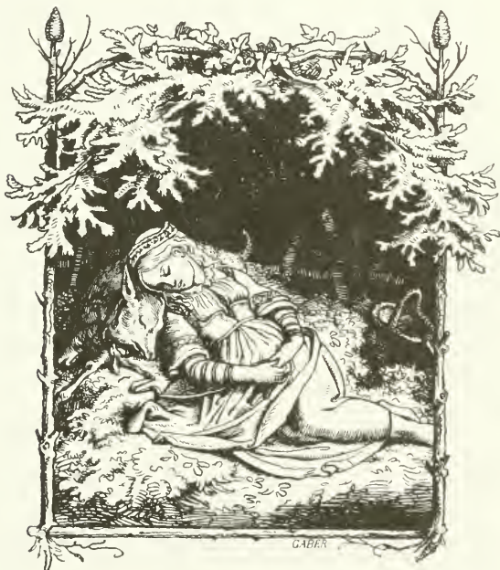
19th-century German illustration from Richter-Album as it appeared in "The Whole World in Their Hands."

Publications on Black Americans—and Bostonians—received particular attention this year. "Spin a Soft Black Song" was built around young people's books. "Black Is..." a popular, handsomely designed annual list of current adult fiction and nonfiction with Black themes went to press once again in time for Black History Month observances. Mindful of the constant demand for activities with emphasis on the