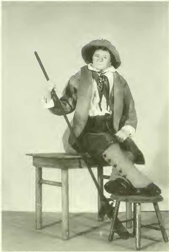
This restored Dennis doll shows actor Joe Jefferson in his interpretation of Rip Van Winkle.