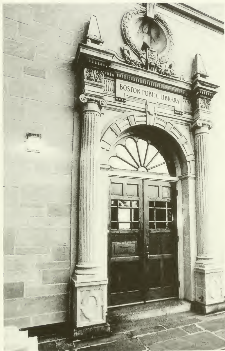
Facade of the Connolly Branch Library, restored inside and out.