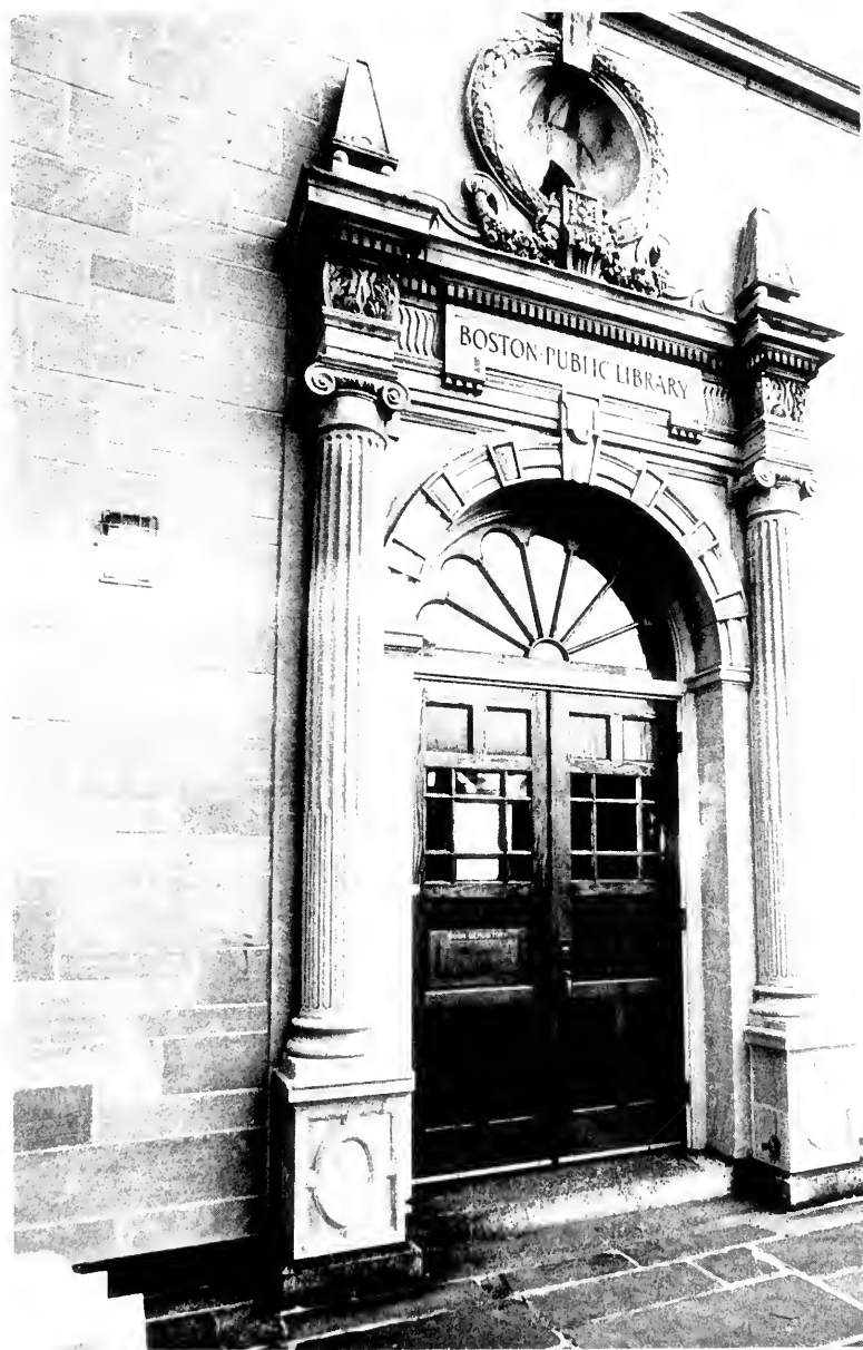
Facade of the Connolly Branch Library, restored inside and out.