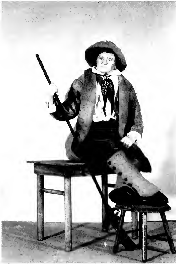
This restored Dennis doll shows actor Joe Jefferson in his interpretation of Rip Van Winkle.