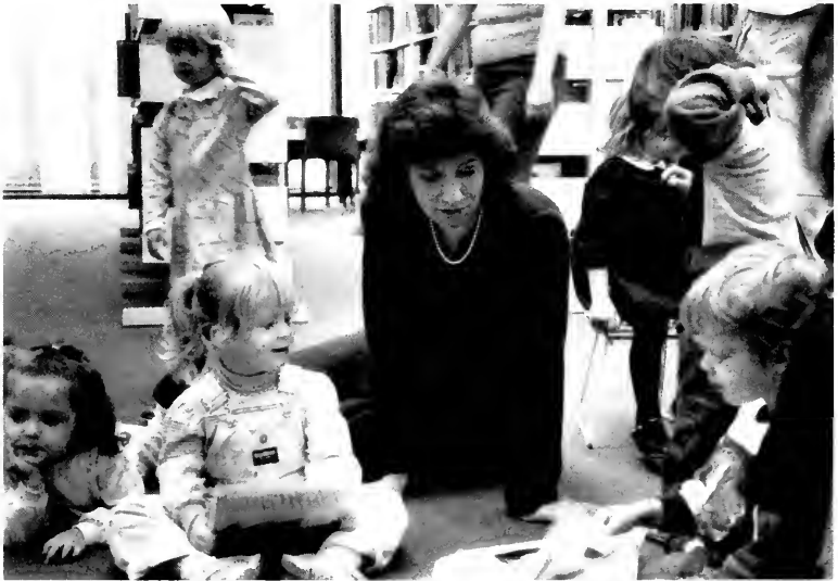
Discovering the world of books.

In a sampling of the activities which compelled the attention and delight of young people, children at Adams Street played BOOK BINGO; Charlestown sponsored Creative Drama during the summer; Brighton held After School Stories and Films; Egleston, Faneuil, Fields Corner, and Jamaica Plain held Toddlers Story Times; Hyde Park held an all-day Trick or Treat; Lower Mills and North End sponsored Puppet Shows; Codman Square and Fields Corner held animal programs featuring guests (human and animal) from the MDC Traveling Zoo and Franklin Park; Egleston Square featured thematic Pirates Day and Detectives Day, also a Teddy Bear Picnic; North End held Story Hours for Mothers and Toddlers, and West Roxbury conducted Pajama Story Hours. Book-related craft programs were frequent: kitemaking and