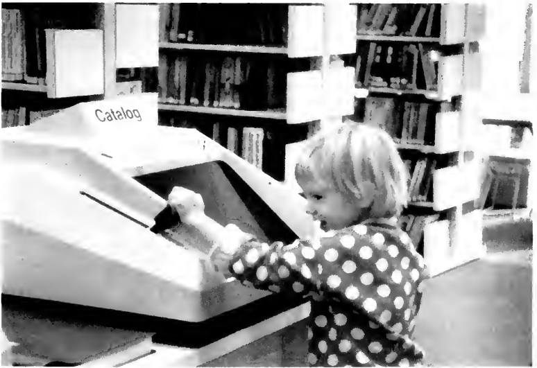
A young expert in information retrieval.

The Government Documents Department received a major bibliographic reference tool, a CD ROM (compact disk, read only memory) U.S. Government Publication Catalog , by which the public can view on a monitor data related to government publications since 1976 (updated monthly). A laser jet printer, also acquired this year, makes it possible for public and staff to print out the data they have rapidly retrieved on the CD ROM.