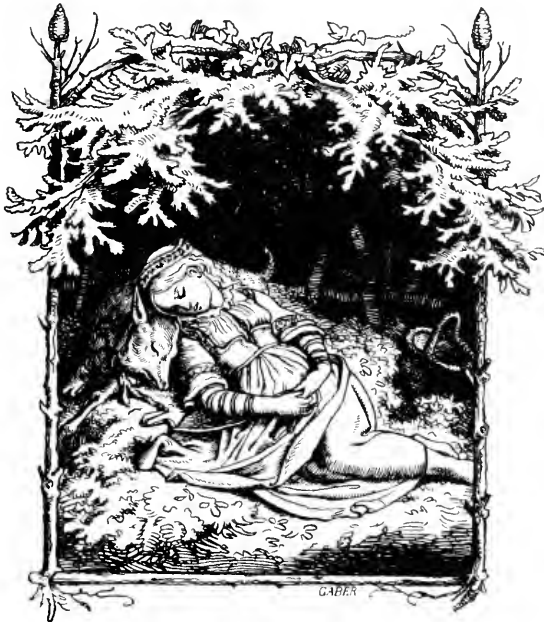
19th-century German illustration from Richter-Album as it appeared in "The Whole World in Their Hands."

Publications on Black Americans—and Bostonians—received particular attention this year. "Spin a Soft Black Song" was built around young people's books. "Black Is..." a popular, handsomely designed annual list of current adult fiction and nonfiction with Black themes went to press once again in time for Black History Month observances. Mindful of the constant demand for activities with emphasis on the