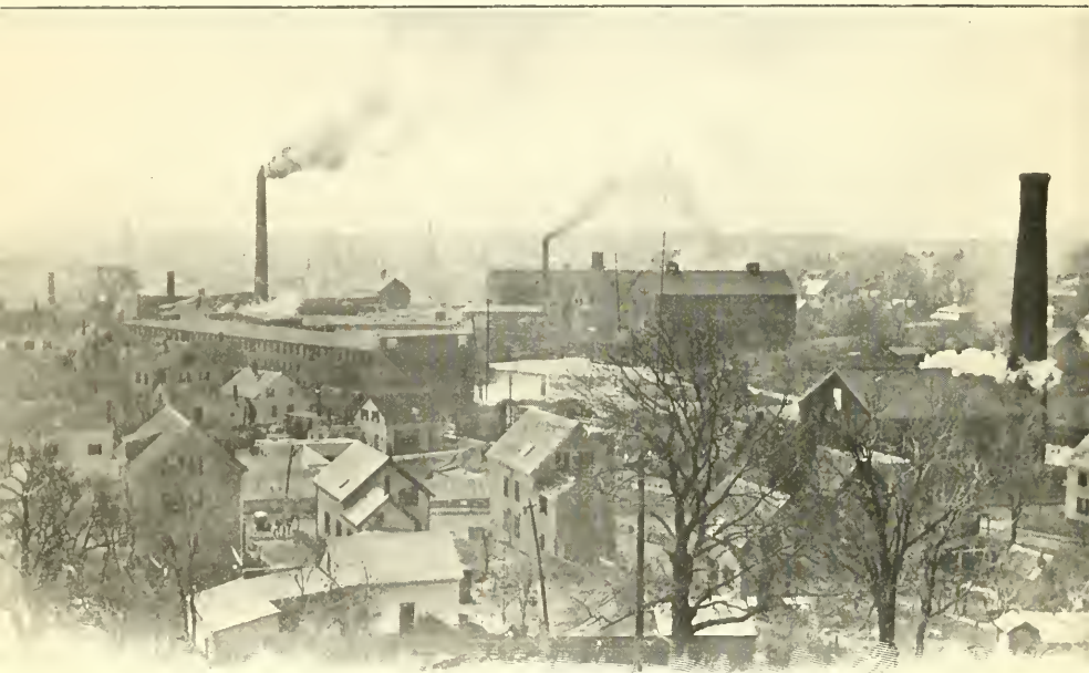
PEABODY, MASS., FROM BUXTON'S HILL, LOOKING SOUTHEAST.

COPYRIGHT 1905 BY PEABODY HISTORICAL SOCIETY, PEABODY, MASS. NO. 14.