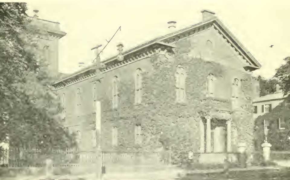
PEABODY INSTITUTE LIBRARY PEABODY MASS.