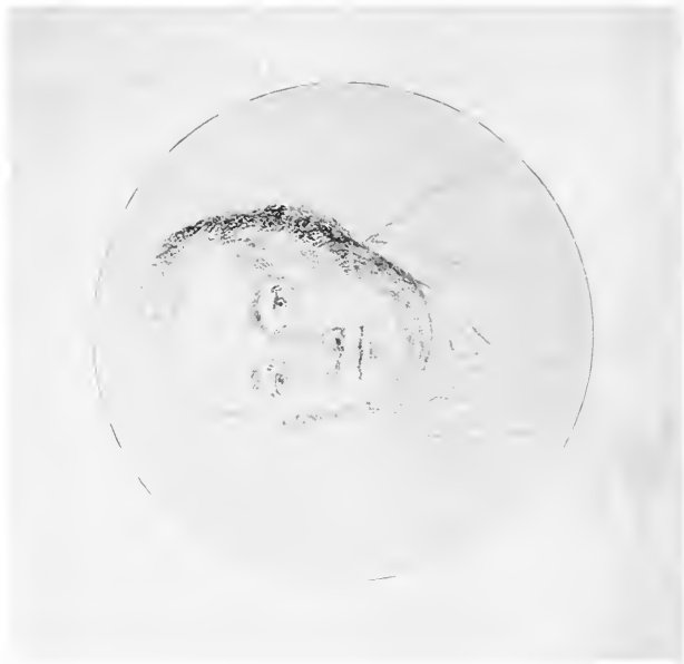
From pencil sketch by Van Hullef, 1811.