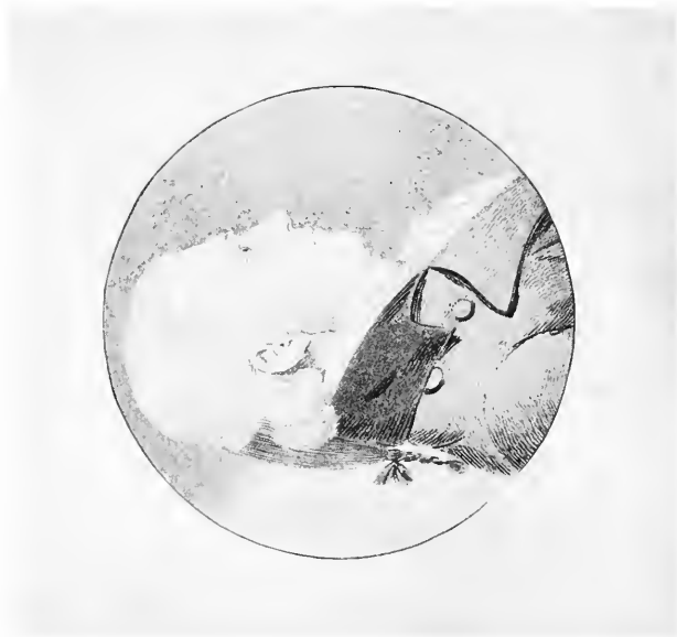
From engraving by St. Mémin, about 1798.